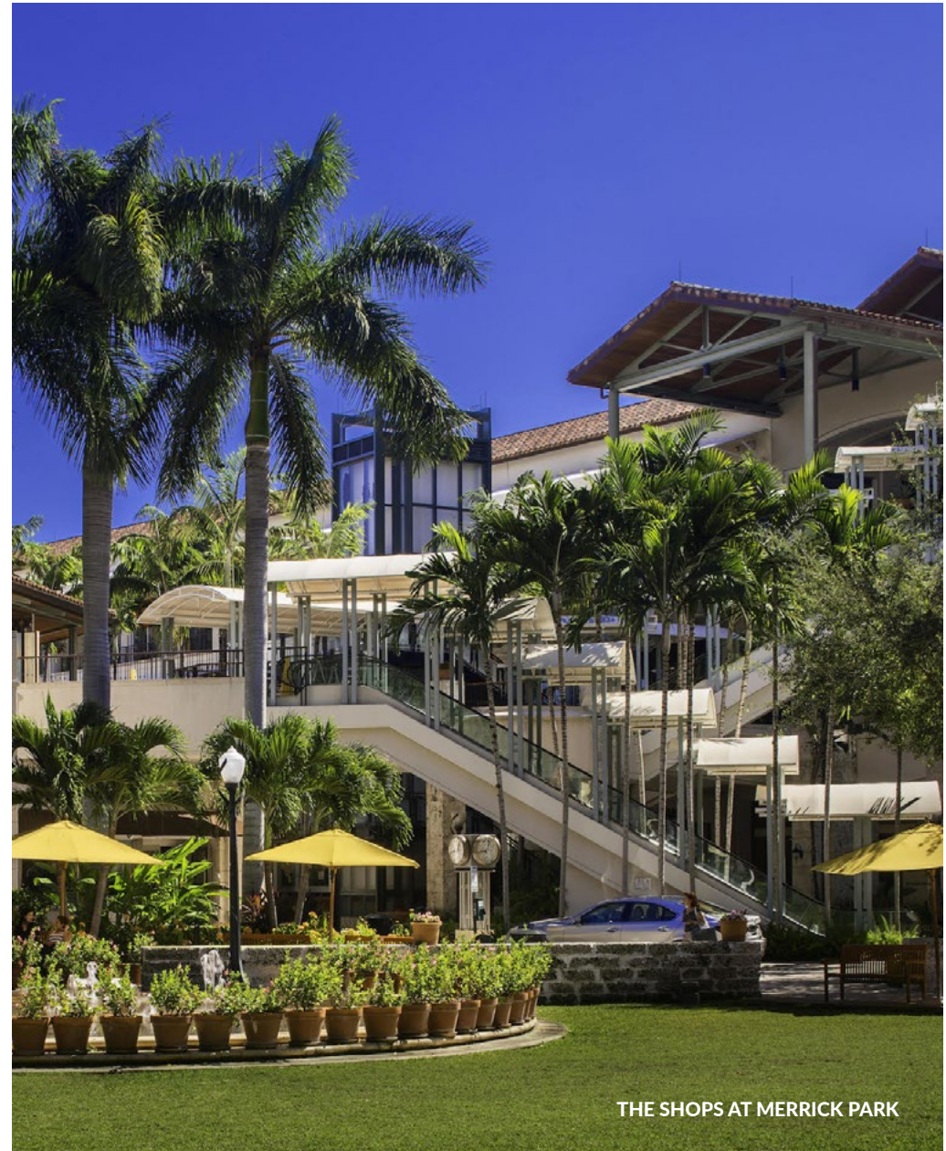
THE SHOPS AT MERRICK PARK

Coral Gables, known as “The City Beautiful,” combines stunning architecture, lush greenery, and a vibrant international community. With over 20 consulates, 140 multinational corporations, and a diverse economy, it serves as a major employment center. The city’s vintage trolley system connects commercial districts, including Ponce de Leon Boulevard and the Metrorail. Home to prestigious institutions like the University of Miami, Coral Gables thrives as a unique and dynamic destination.