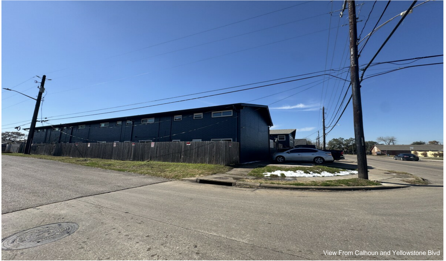
View From Calhoun and Yellowstone Blvd