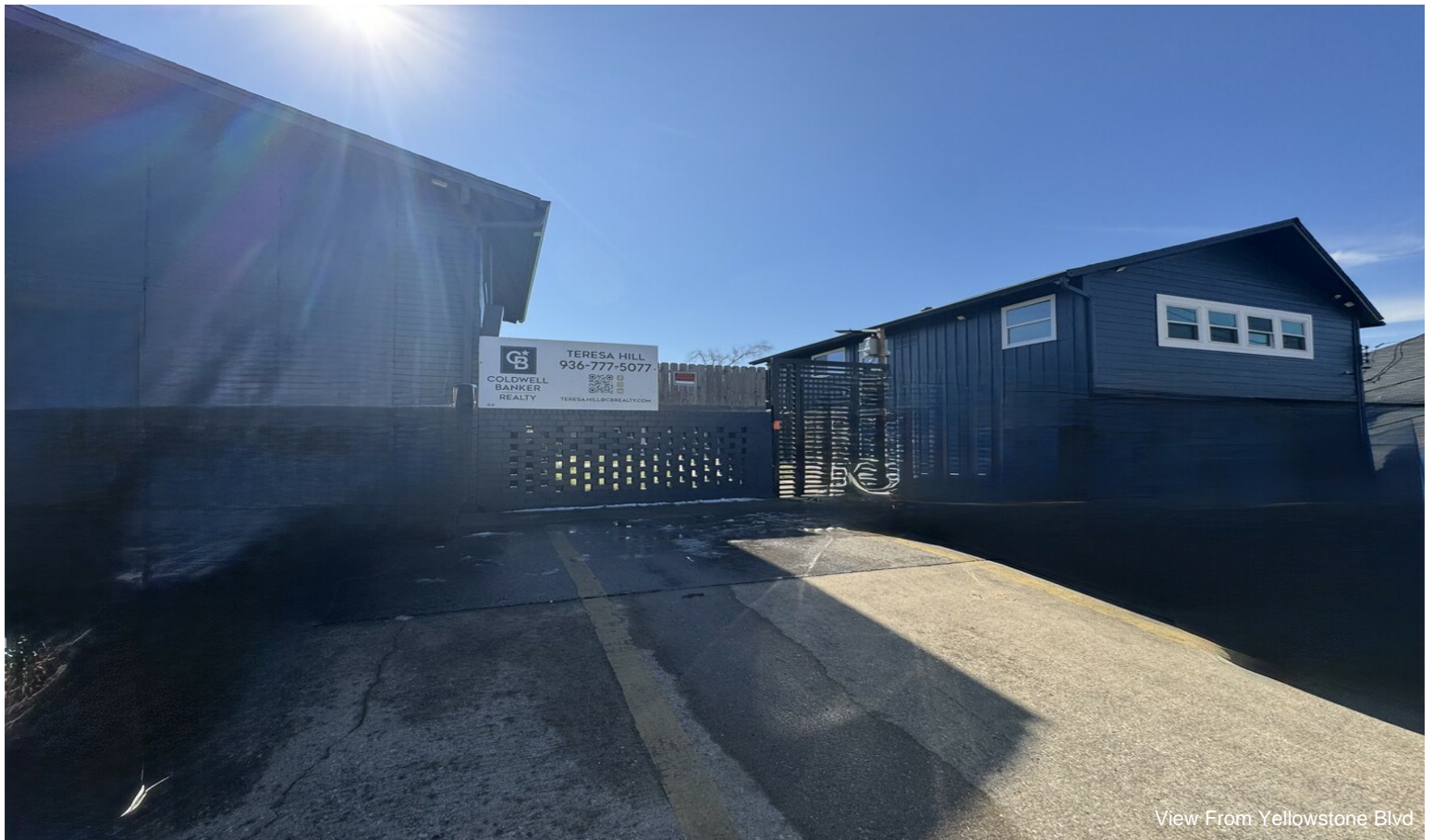
View From Yellowstone Blvd