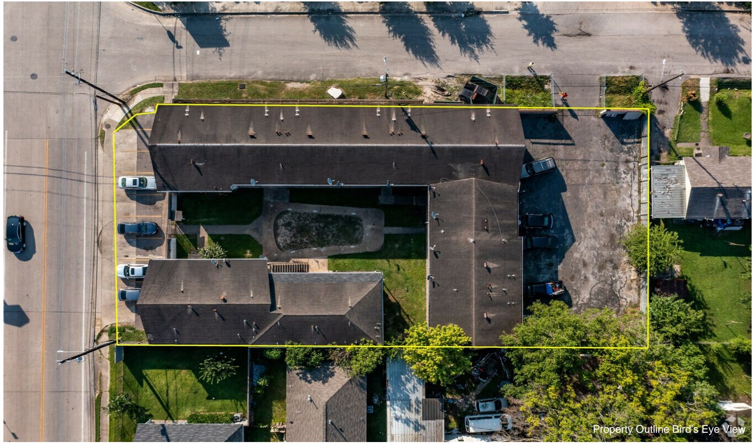
Property Outline Bird's Eye View