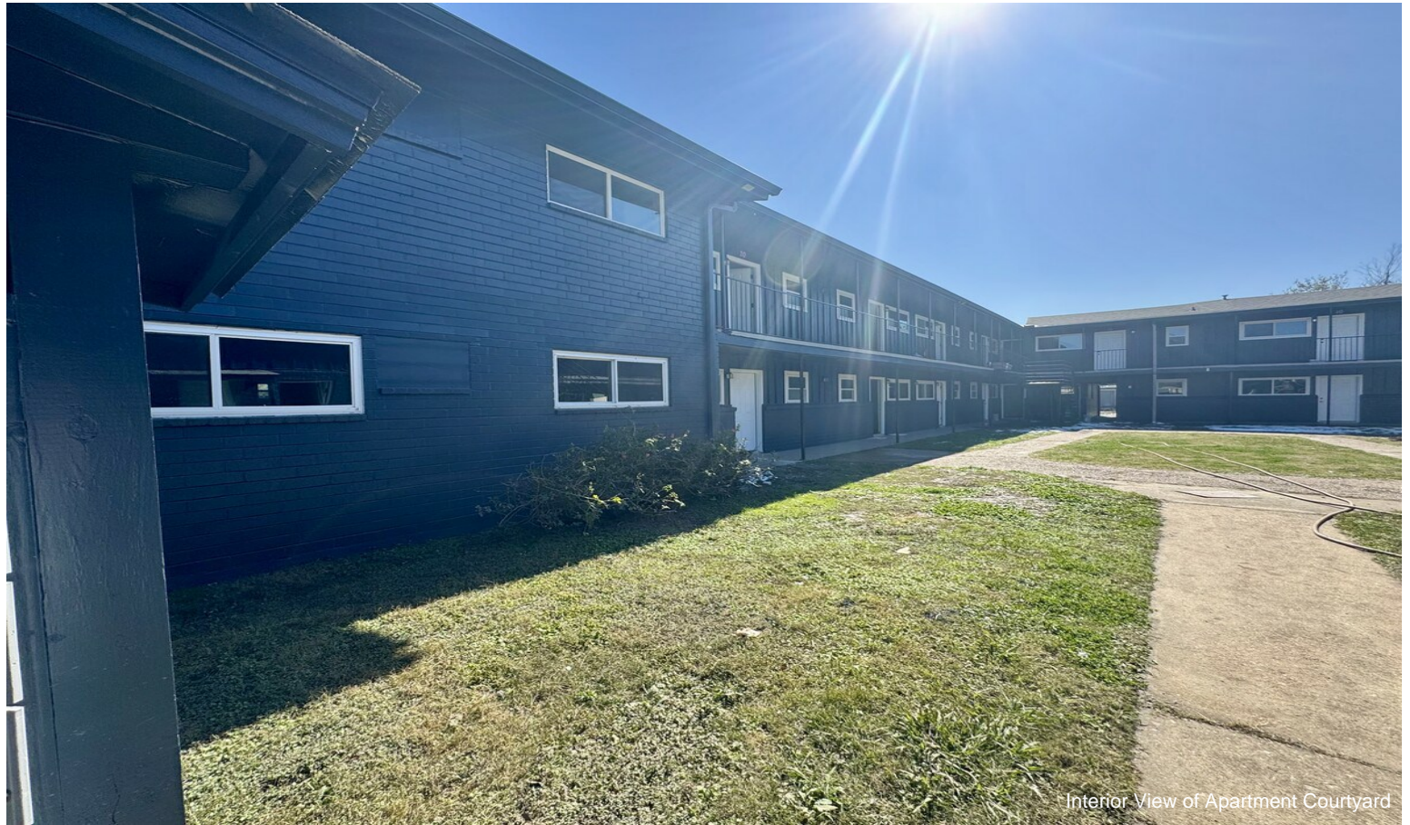
Interior View of Apartment Courtyard