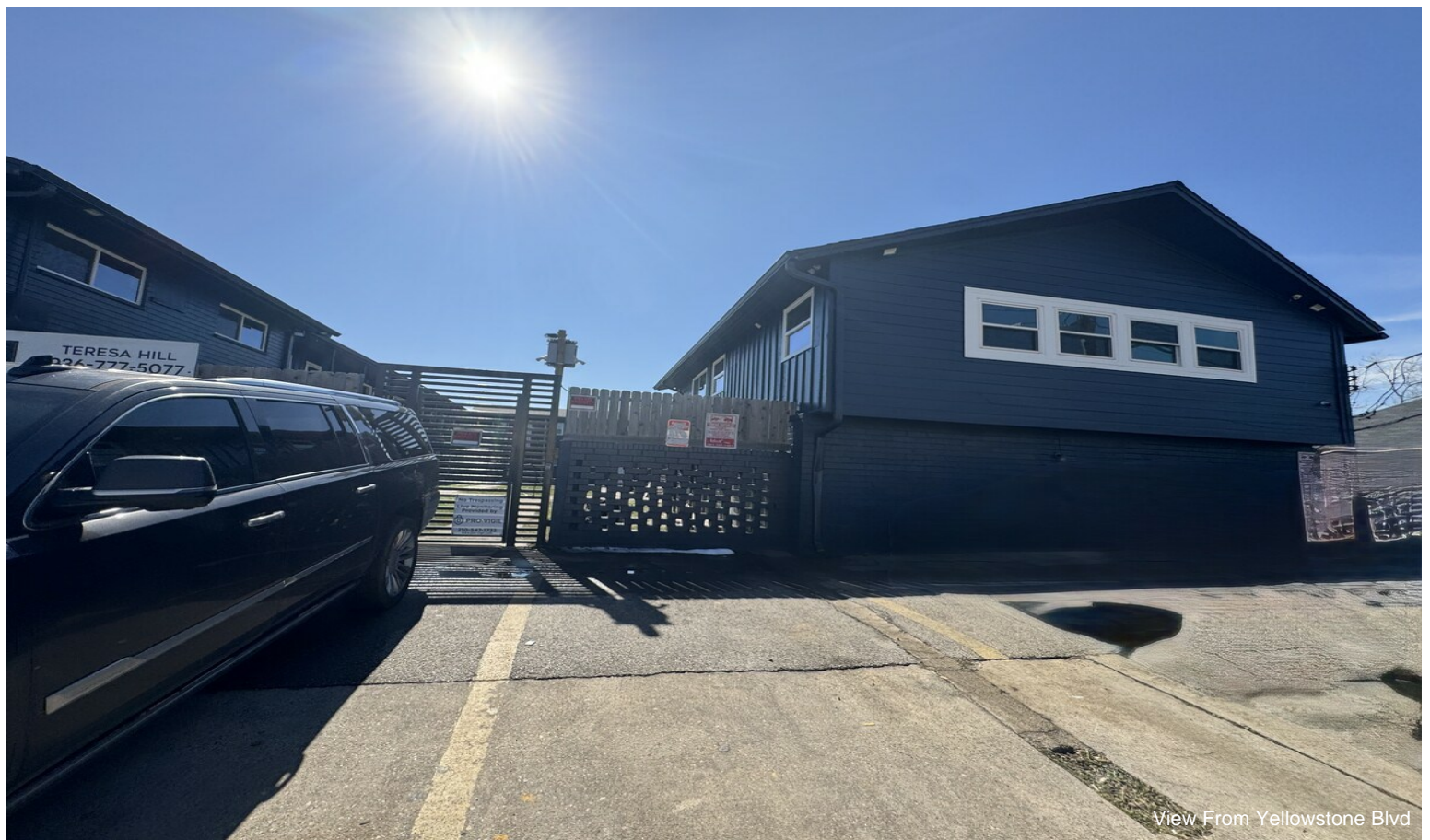
View From Yellowstone Blvd