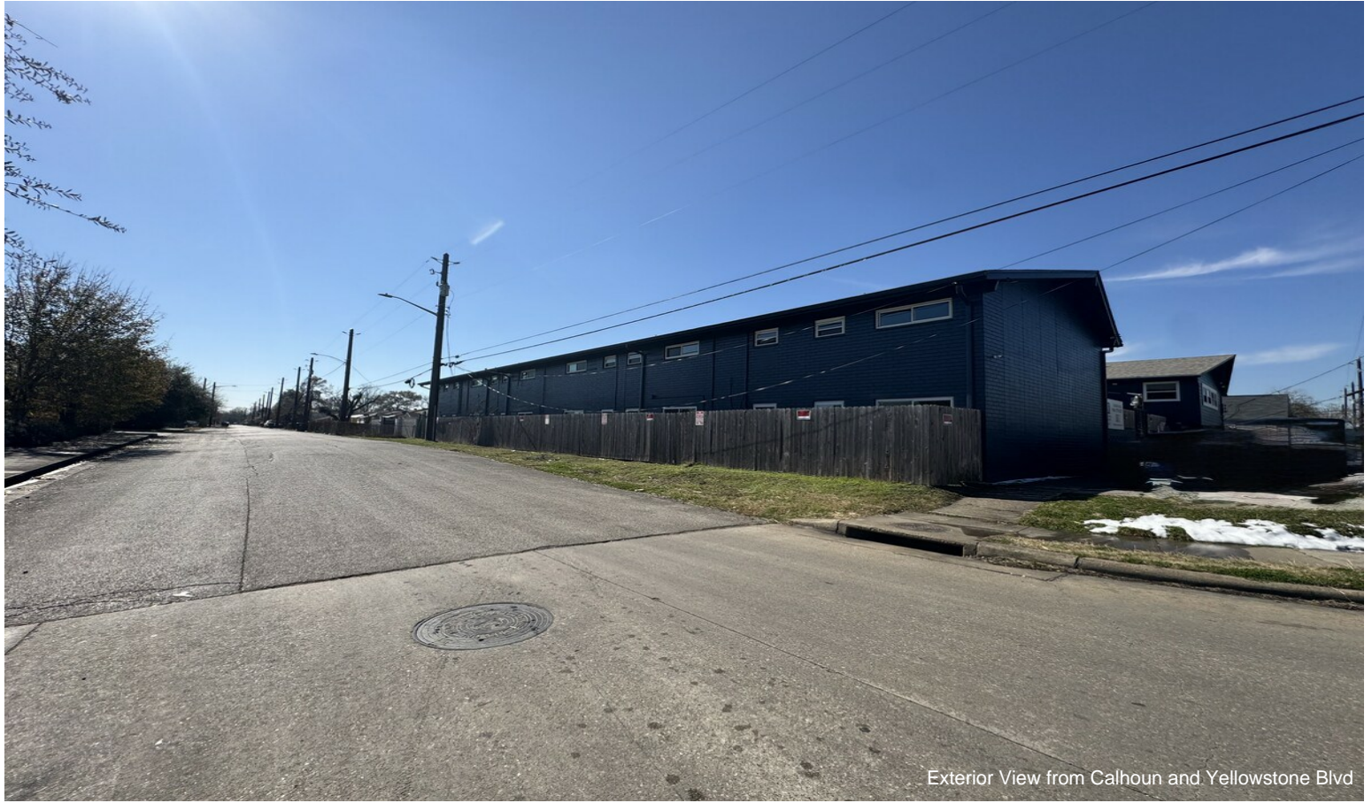
Exterior View from Calhoun and Yellowstone Blvd