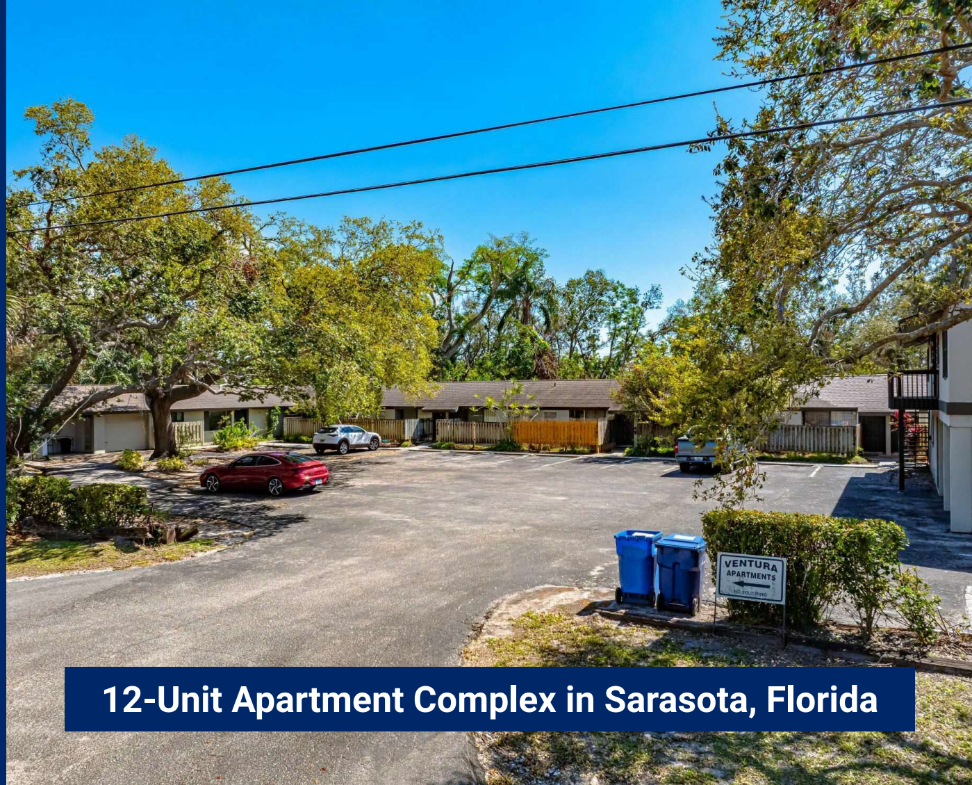
12-Unit Apartment Complex in Sarasota, Florida