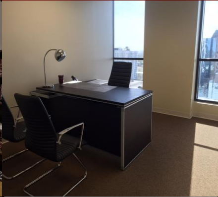
Up to 3-6 people