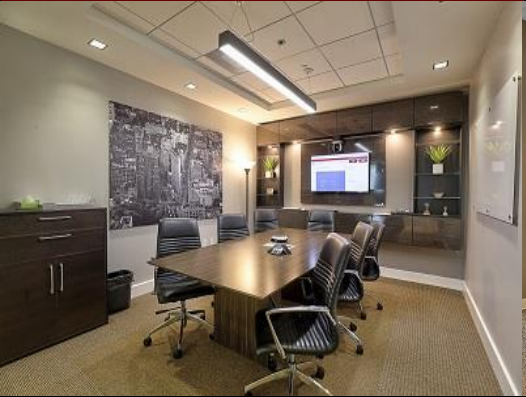
Up to 8 people