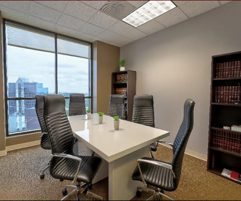
Up to 6 people