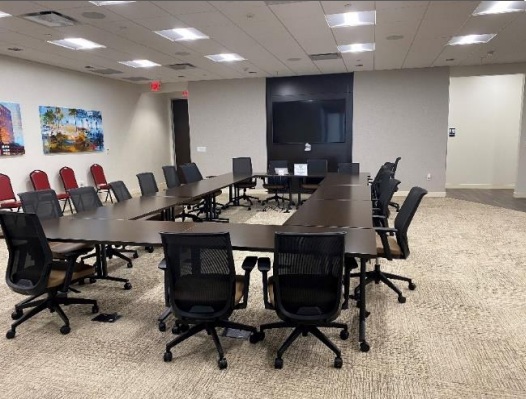
Up to 40 people