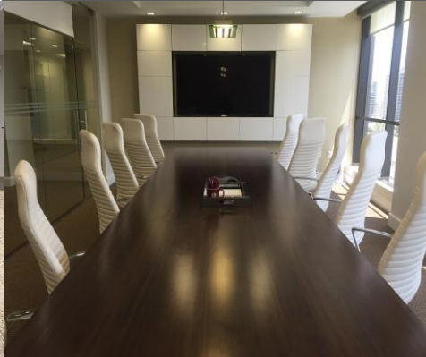
Up to 16 people