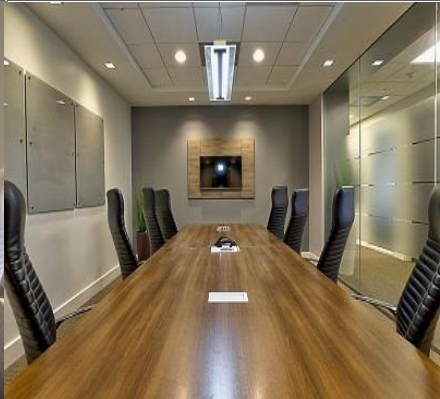
Up to 12 people