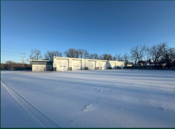
Ancillary Building on Hill - 11,590 SF