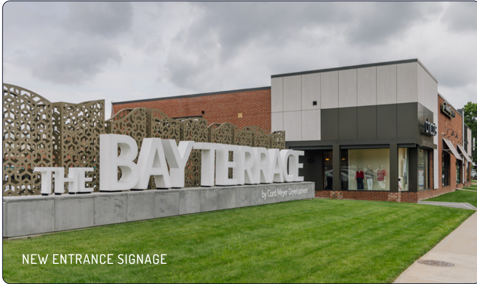
NEW ENTRANCE SIGNAGE

Extensive shopping center renovations completed including facade upgrades, updated landscaping, signage improvements, outdoor dining and seating areas...and we are not done yet! Watch us grow!