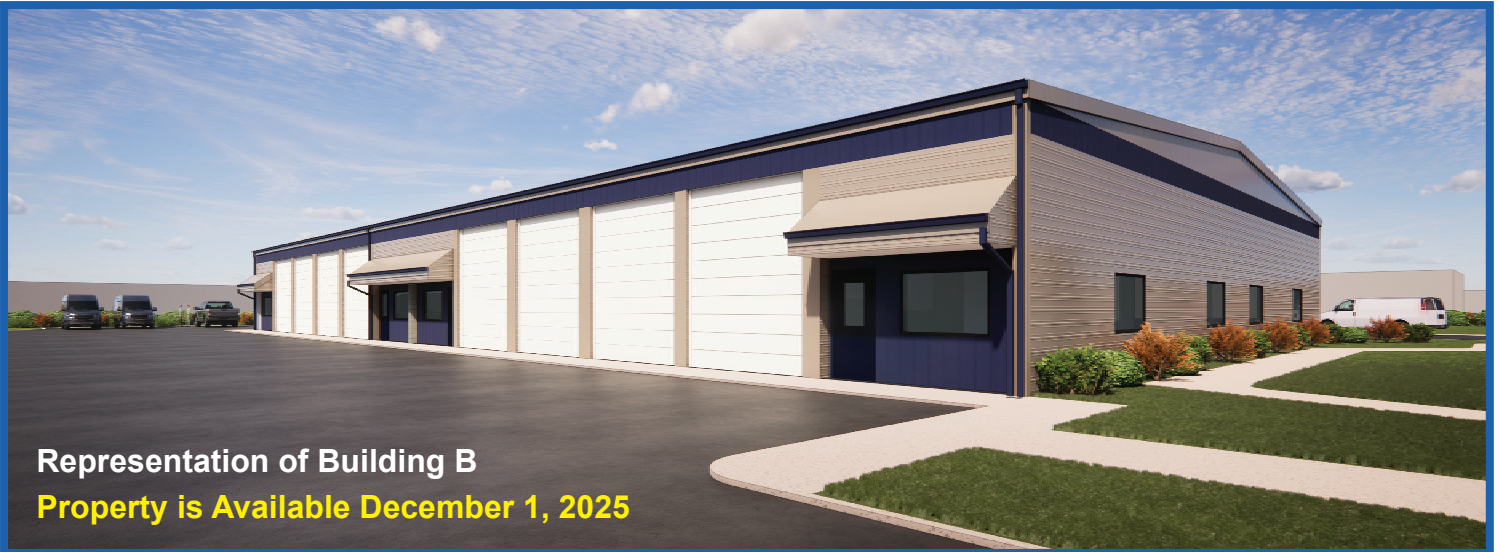
Representation of Building B

2410 Roosevelt Avenue • Vancouver, WA 98660