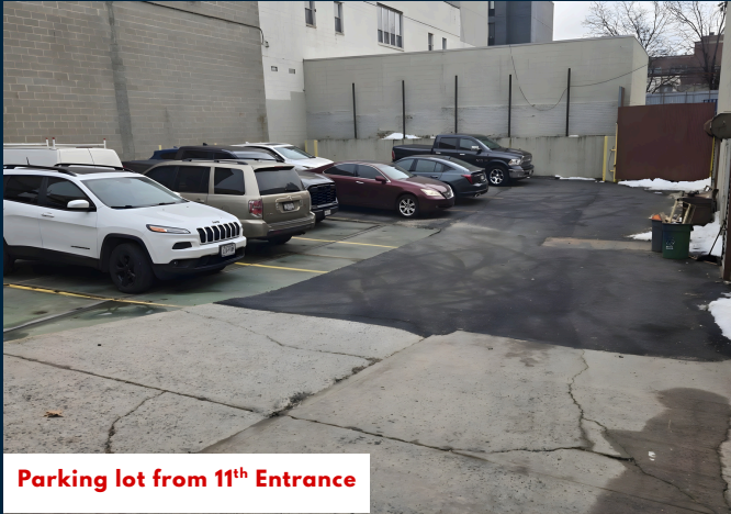
Parking lot from 11 th Entrance

37-14 12 TH ST., Long Island City, NY 11101