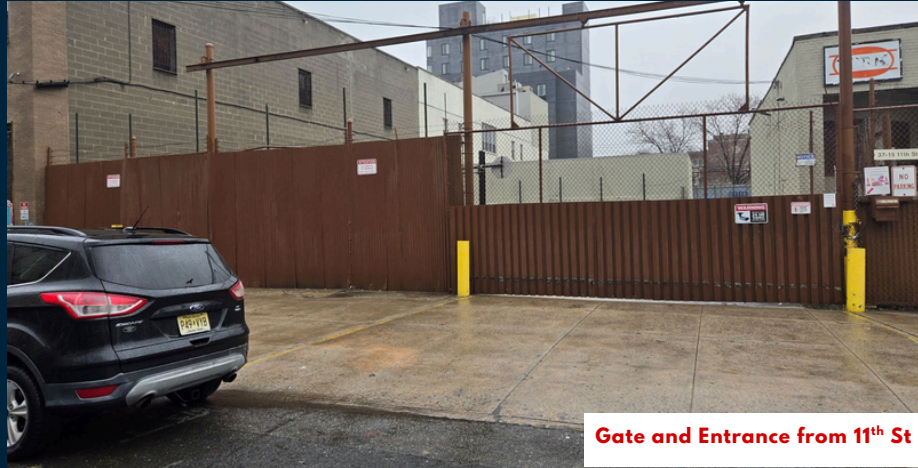
Gate and Entrance from 11 th St