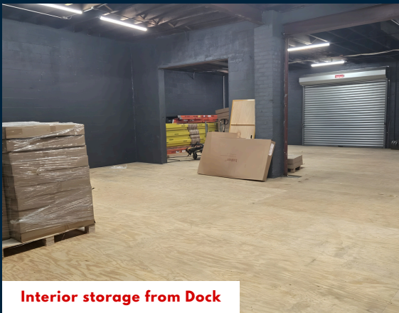
Interior storage from Dock