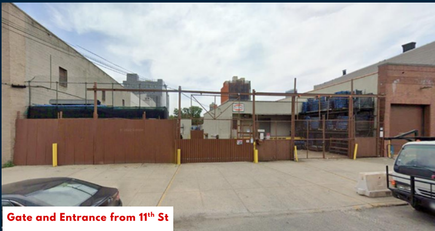
Gate and Entrance from 11 th St