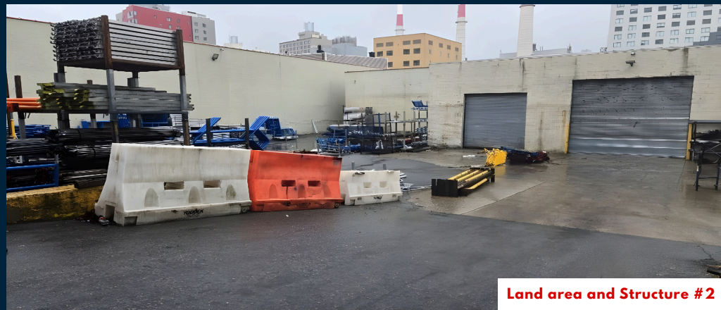
Land area and Structure #2