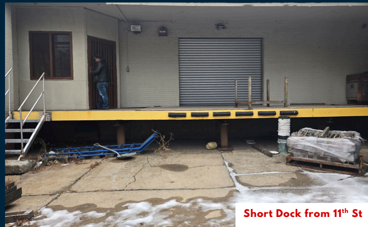
Short Dock from 11 th St