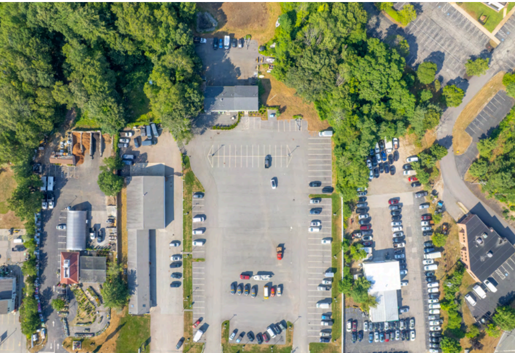
775 Washington Street - Retail Pad Site Available For Lease