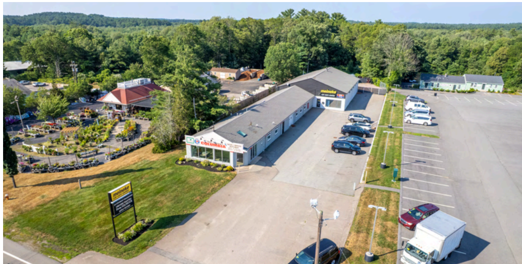
785 Washington Street - ±3,024 SF Freestanding Flex Building For Lease