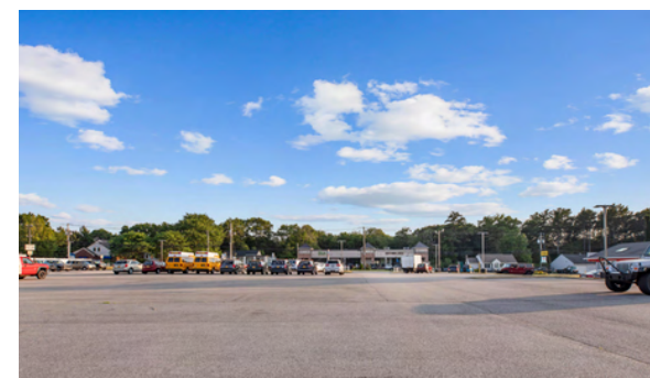
775 Washington Street Retail/Medical Pad Site Available