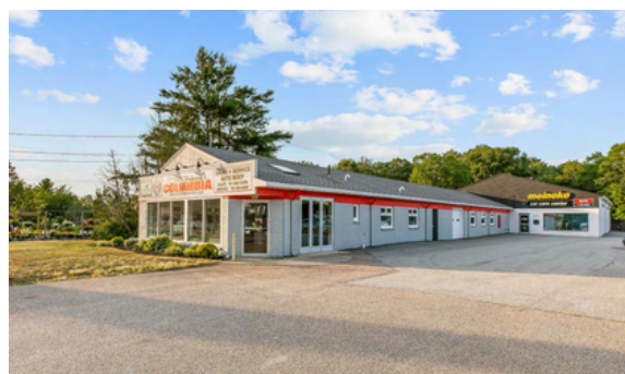
785 Washington Street ±3,024 SF Flex Space For Lease