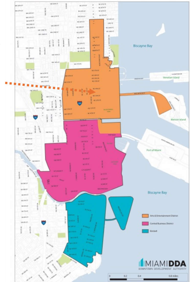
Map of Miami Downtown Development Authority Boundary/Districts

Tourists and locals alike are drawn to the A&E District's cultural richness, which includes renowned institutions such as the Adrienne Arsht Center for the Performing Arts, the Live Modern School of Music, the Perez Art Museum, and the Patricia and Philip Frost Museum of Science. These cultural gems contribute to the district's allure, making it a dynamic and engaging place to live or explore.