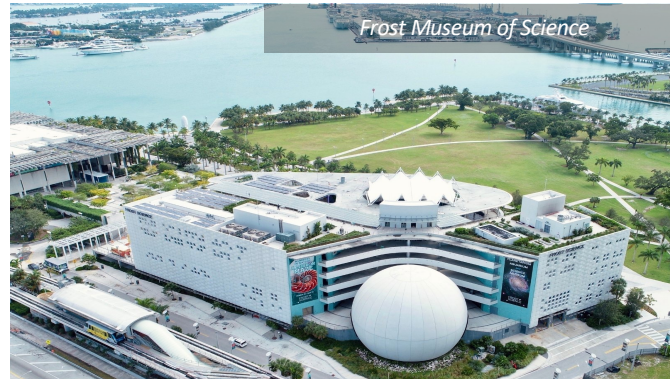
Frost Museum of Science