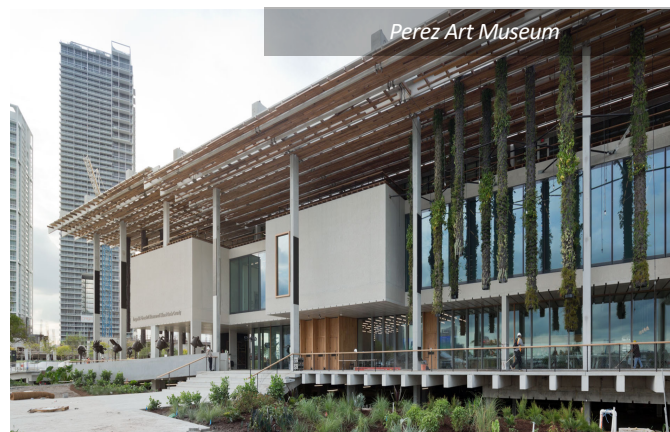
Perez Art Museum