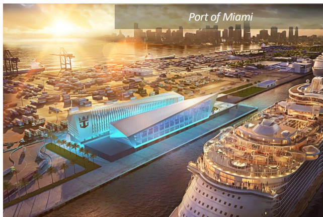
Port of Miami