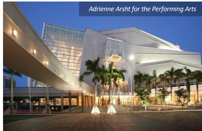
Adrienne Arsht for the Performing Arts