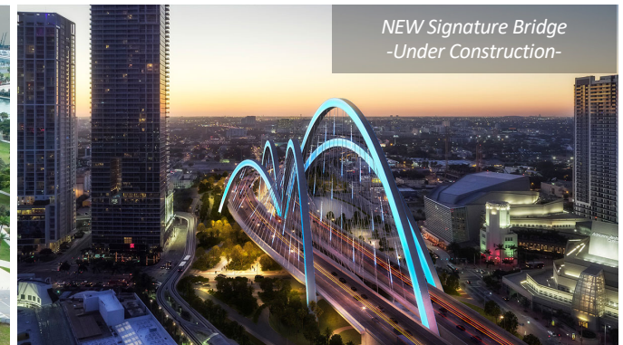
NEW Signature Bridge -Under Construction-