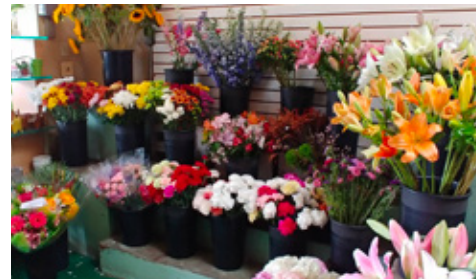
MYSTIC GARDEN FLORIST