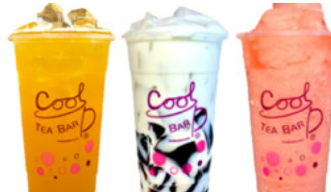
MY CUP OF TEA