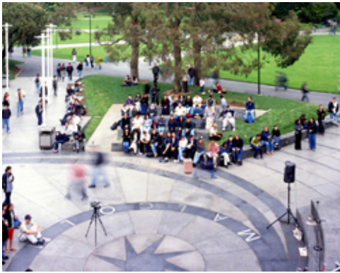
SF STATE UNIVERSITY