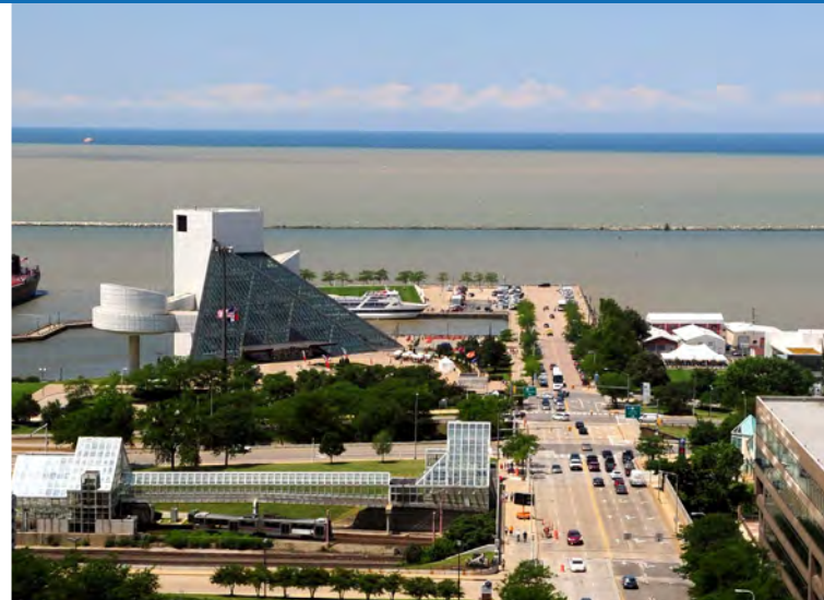
Excellent views of Downtown Cleveland and Lake Erie