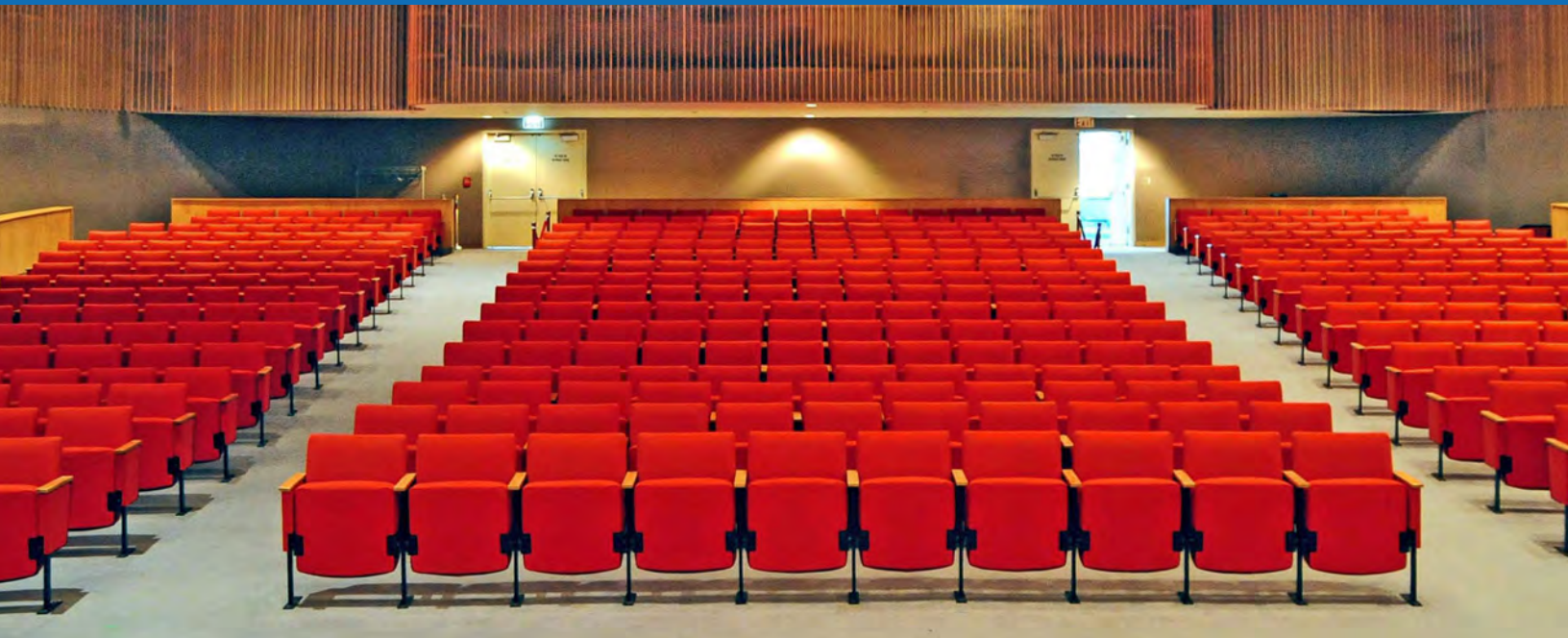
State-of-the-art conferencing facility featuring a 403-seat auditorium and 15 meeting rooms with conferencing, training and banquet facilities. Professionally managed and operated with available on-site full catering.