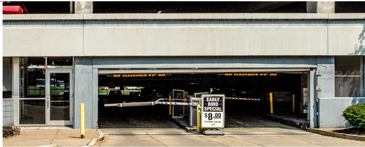
Attached 1,100-space parking garage