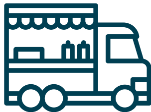
New Food Truck Court