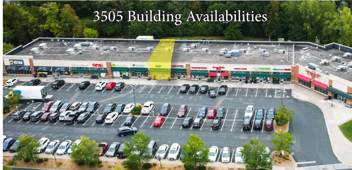
3505 Building Availabilities