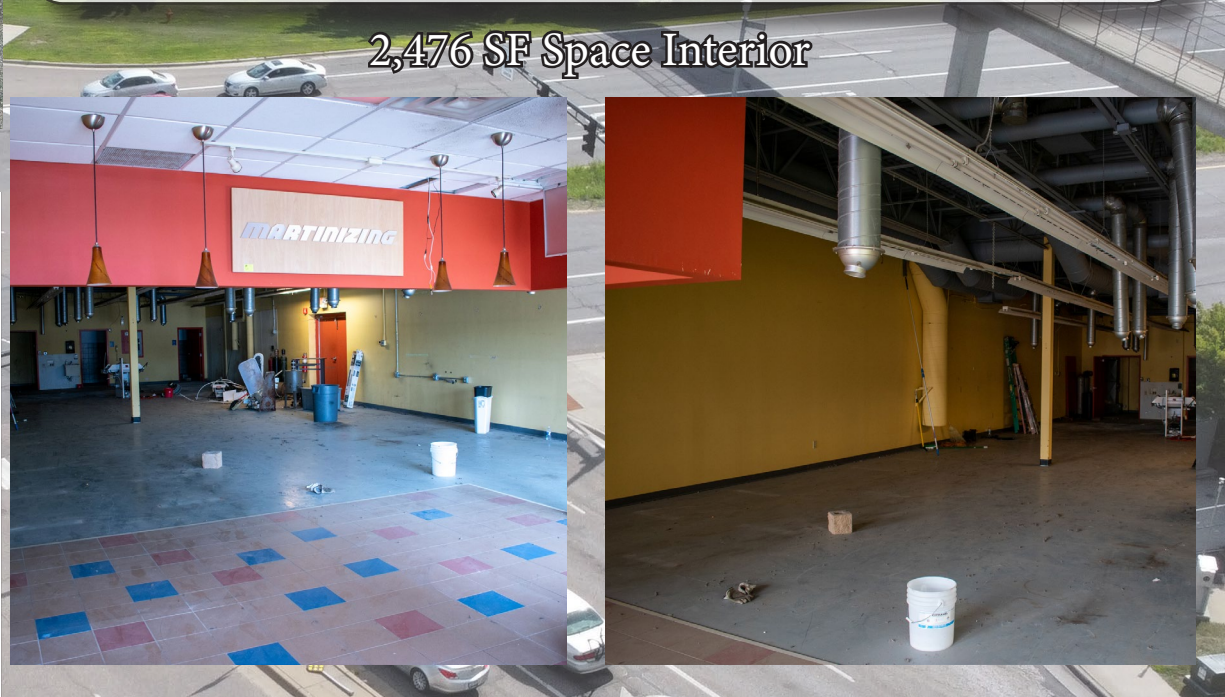
2,476 SF Space Interior