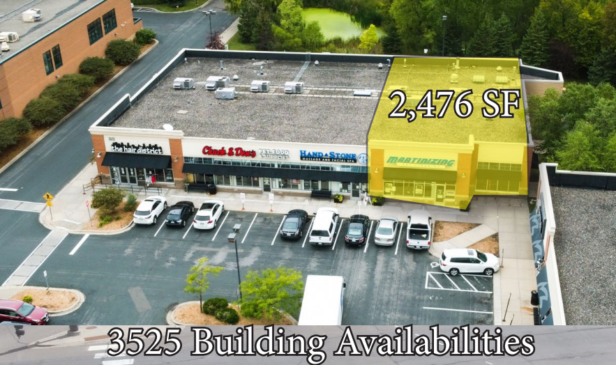
3525 Building Availabilities