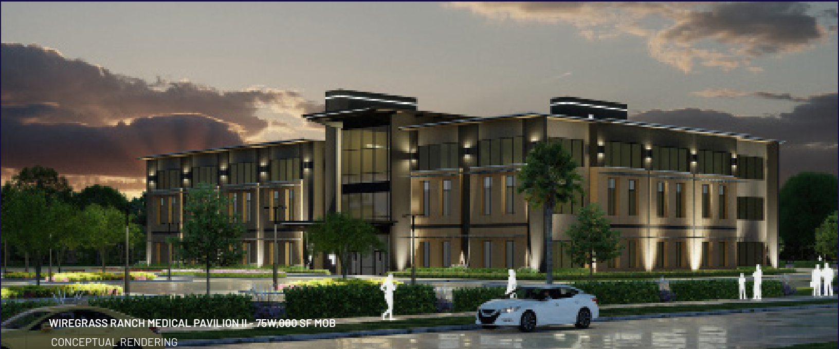
WIREGRASS RANCH MEDICAL PAVILION II - 75W,000 SF MOB CONCEPTUAL RENDERING

WIREGRASS RANCH MEDICAL PAVILION I & II WESLEY CHAPEL, FLORIDA