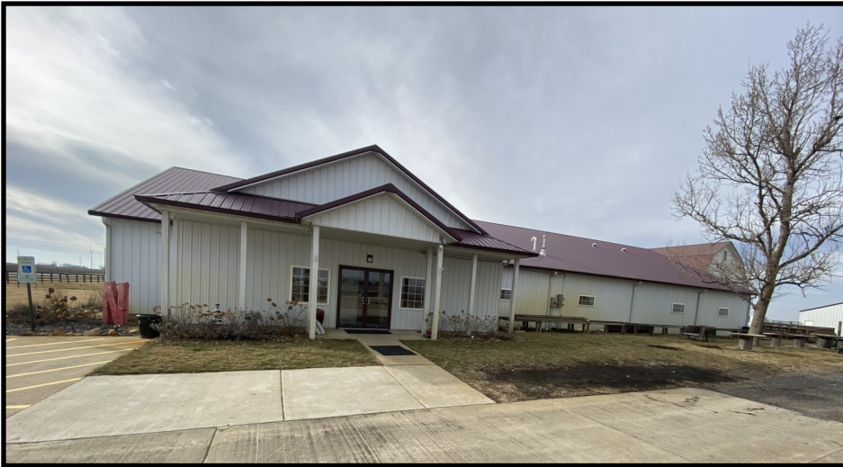
Morton Building finished as retail/ office/warehouse