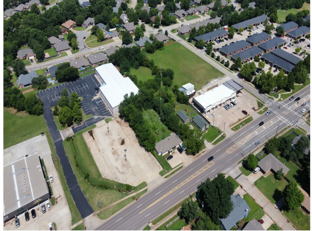
ALT CORNER VIEW