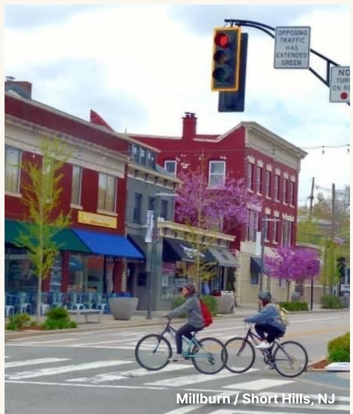
Millburn / Short Hills, NJ