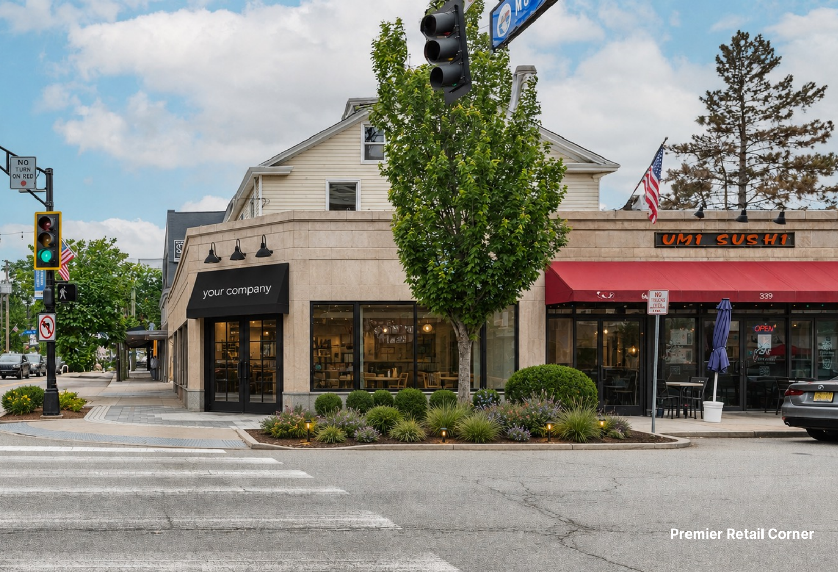
Premier Retail Corner