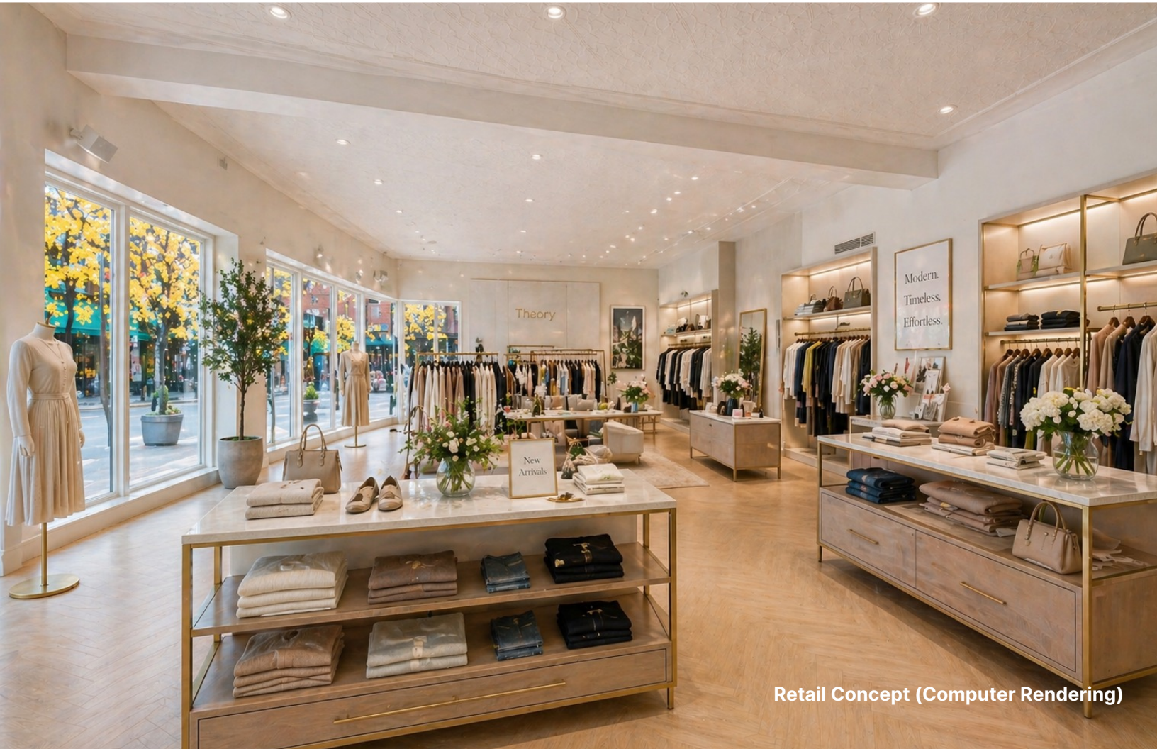
Retail Concept (Computer Rendering)