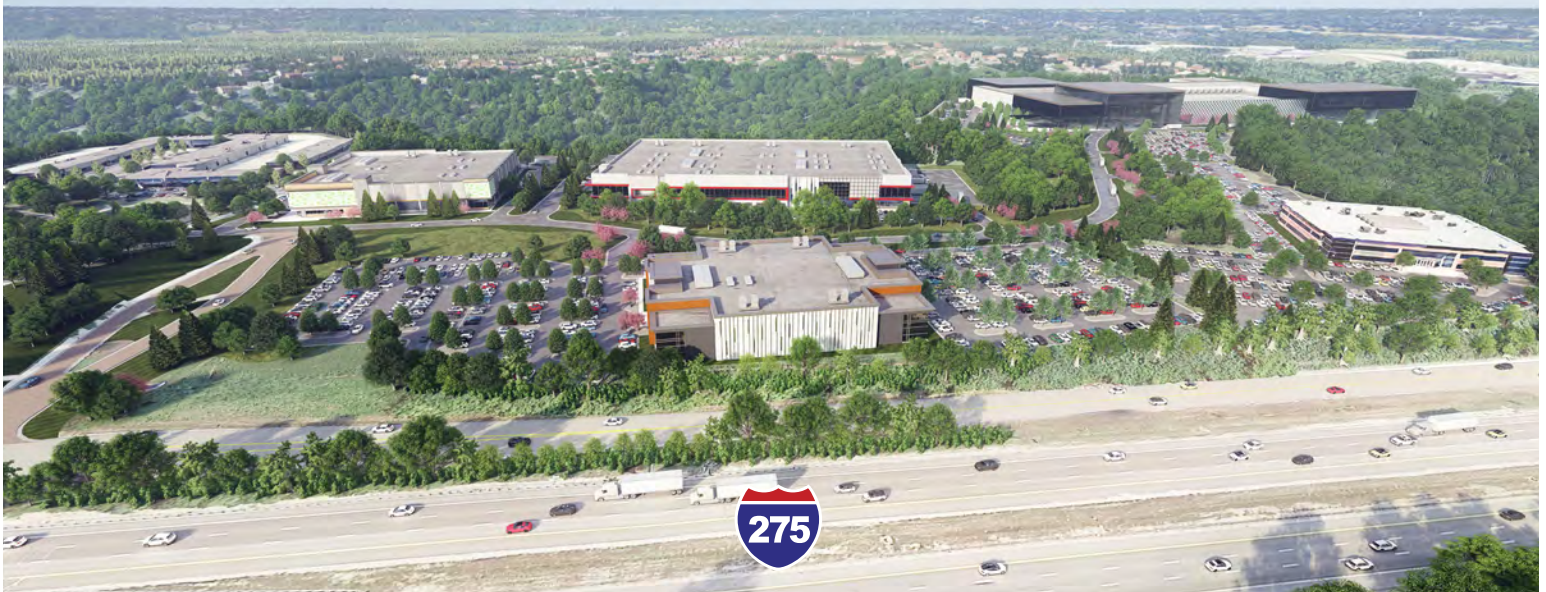
Conceptual Development Rendering