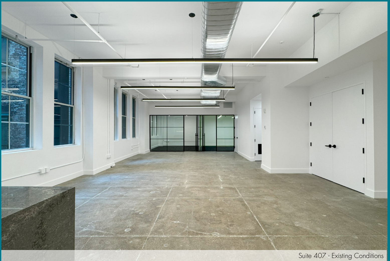
Suite 407 - Existing Conditions