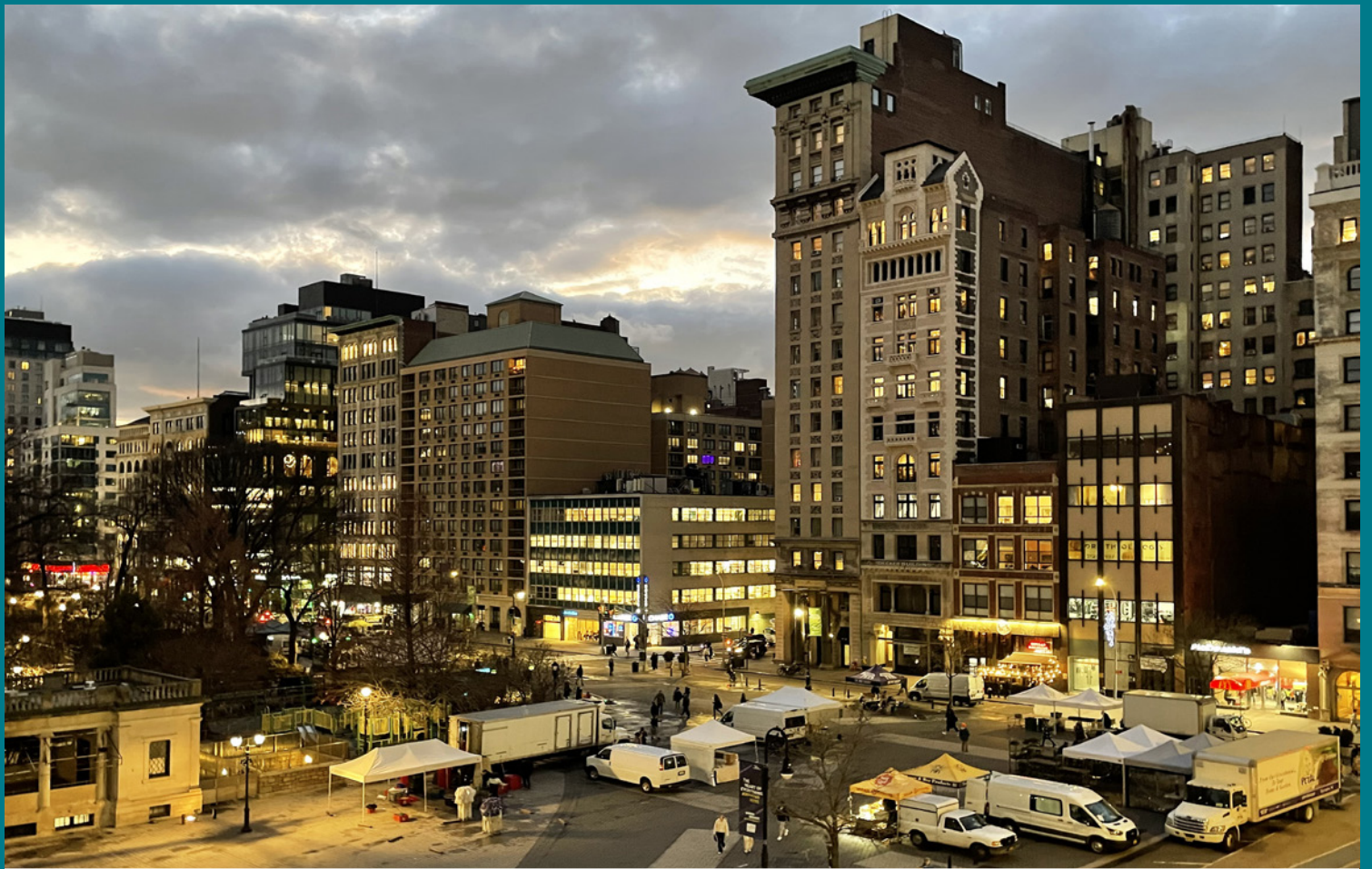
South View at Dusk