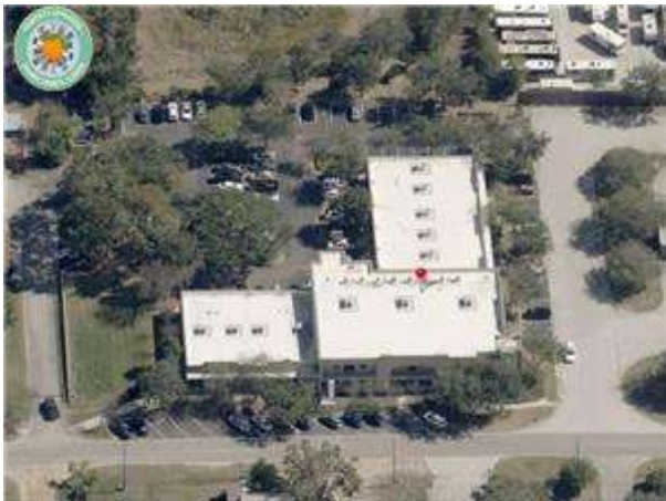
301 S TUBB ST UNIT G1, OAKLAND, FL 34760 02/14/2019