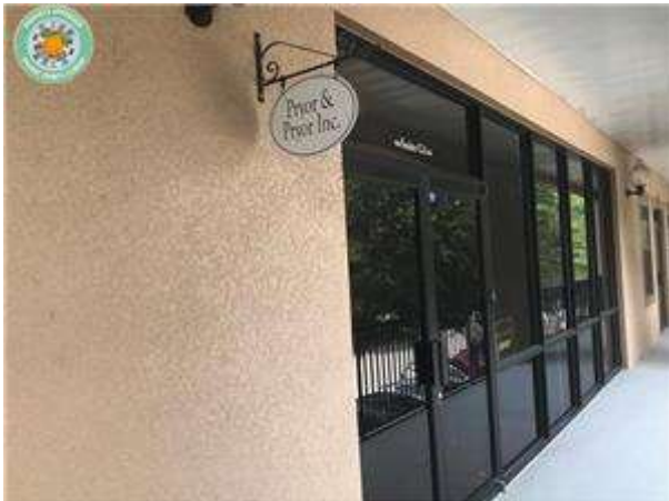
301 S TUBB ST UNIT G1, OAKLAND, FL 34760 5/31/2023 3:43 PM