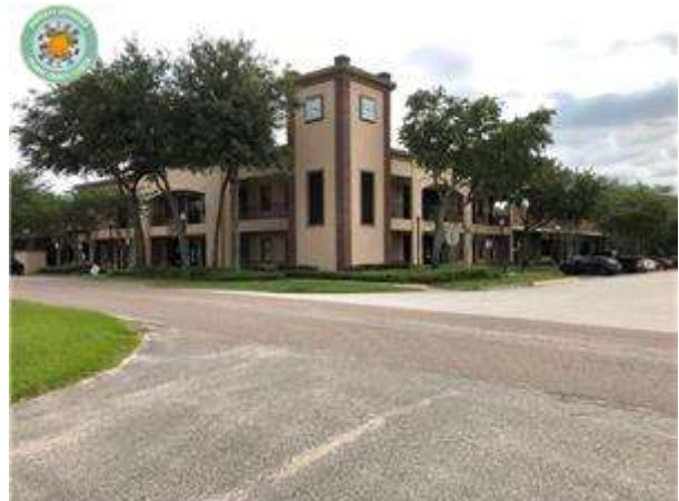
301 S TUBB ST UNIT G1, OAKLAND, FL 34760 5/15/2019 9:21 AM