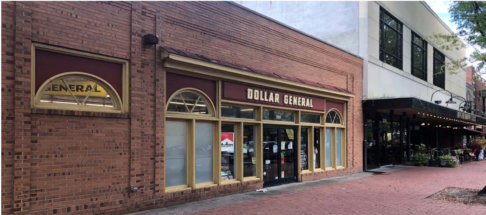
Retail Building | 326 High Street, Portsmouth, Virginia