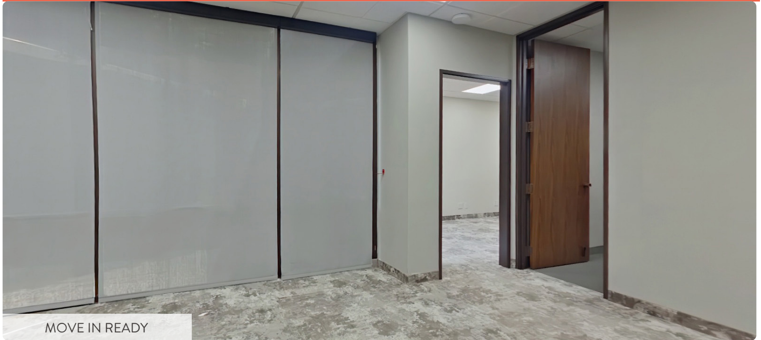
MOVE IN READY

3033 KELLWAY DRIVE | CARROLLTON, TX 75006