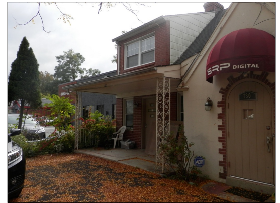
728 Haverford Road