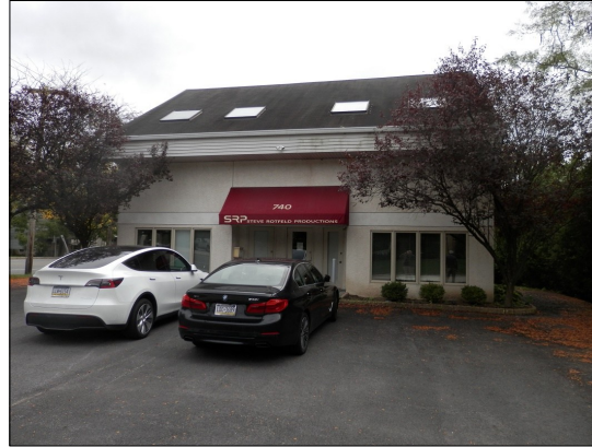
740 Haverford Road