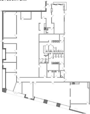
AS-BUILT OFFICE PLAN 1ST FLOOR: OFFICE 8,216 SF