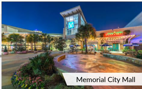
Memorial City Mall