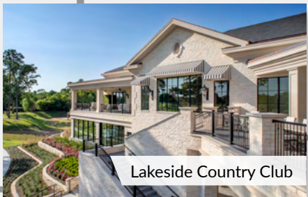
Lakeside Country Club