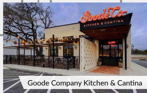
Goode Company Kitchen & Cantina