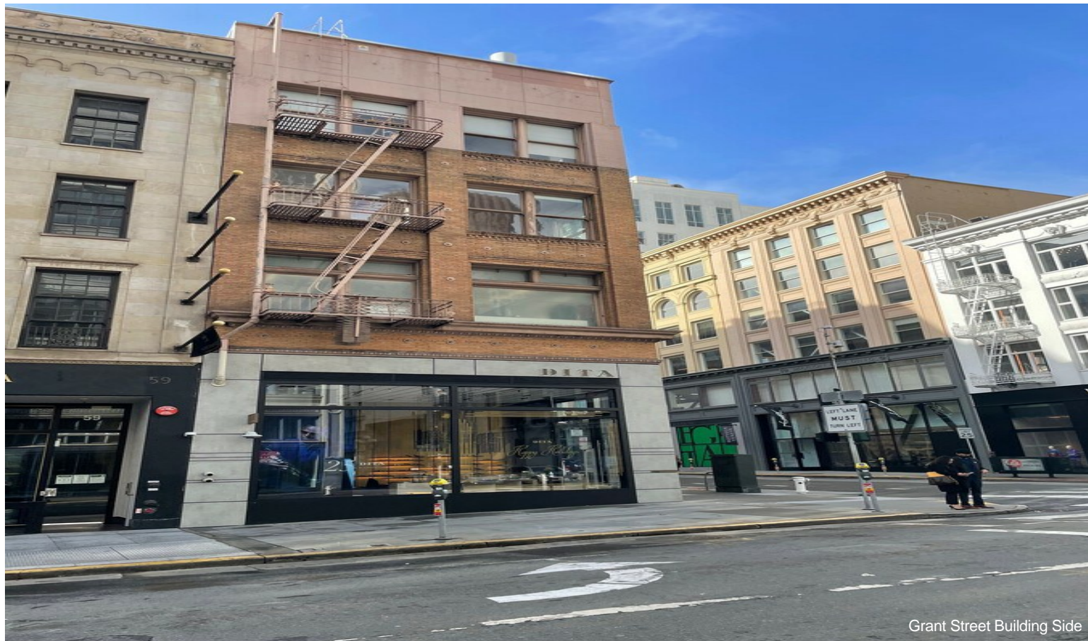
Grant Street Building Side