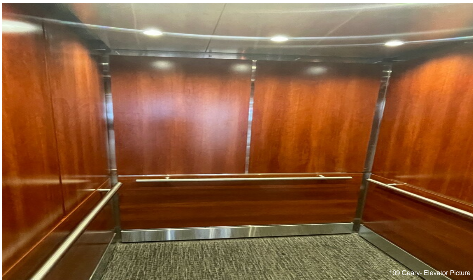
109 Geary- Elevator Picture