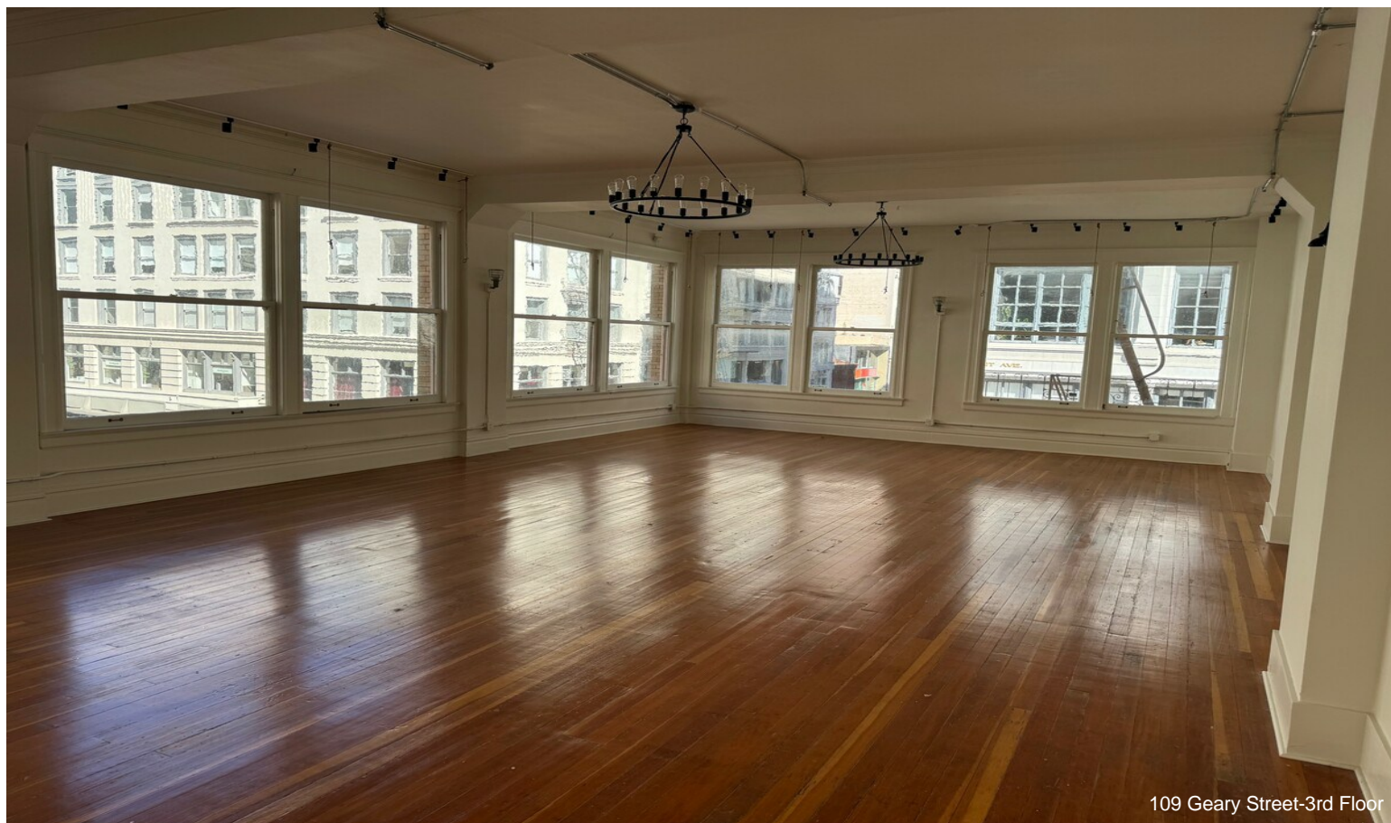
109 Geary Street-3rd Floor