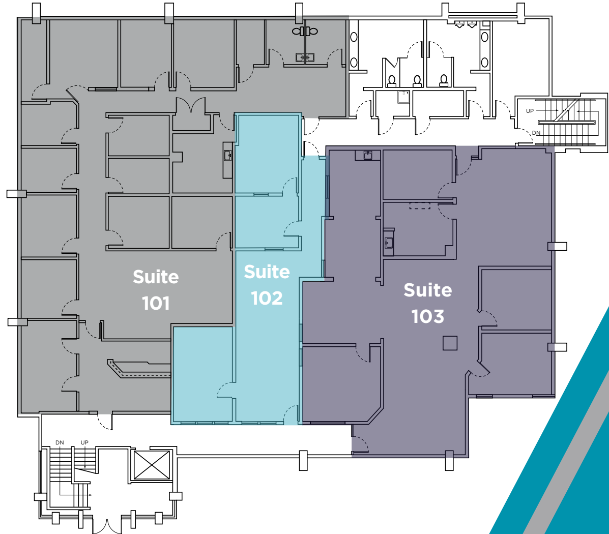
FIRST LEVEL FLOOR PLAN