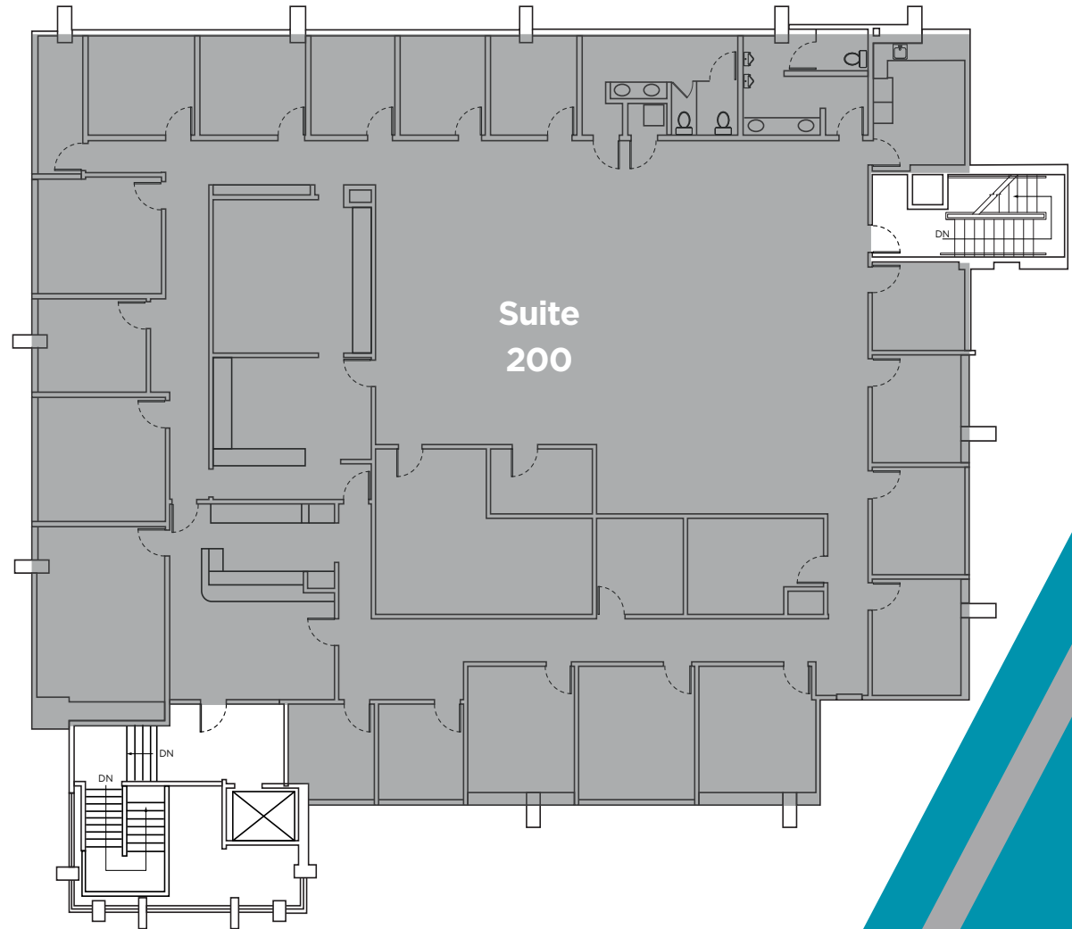
SECOND LEVEL FLOOR PLAN