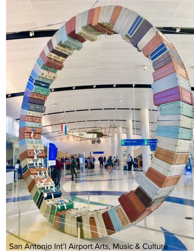
San Antonio Int'l Airport Arts, Music & Culture

Located in Bulverde, one of the fastest-growing areas north of San Antonio, the site benefits from its position between major economic centers and service centers like San Antonio & New Braunfels, offering excellent workforce availability and regional reach.