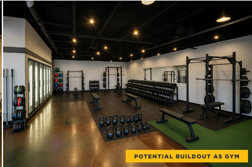
POTENTIAL BUILDOUT AS GYM