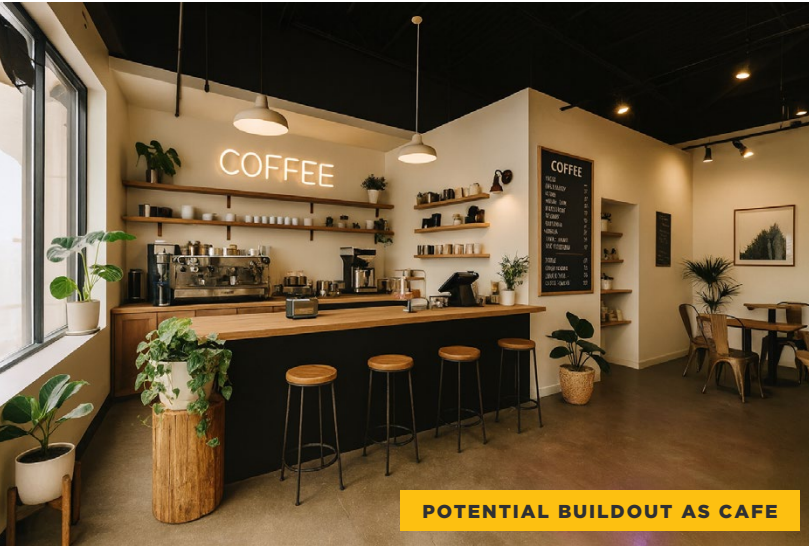
POTENTIAL BUILDOUT AS CAFE