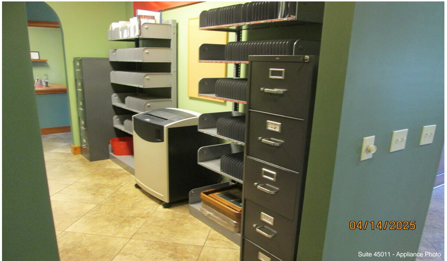
Suite 45011 - Appliance Photo