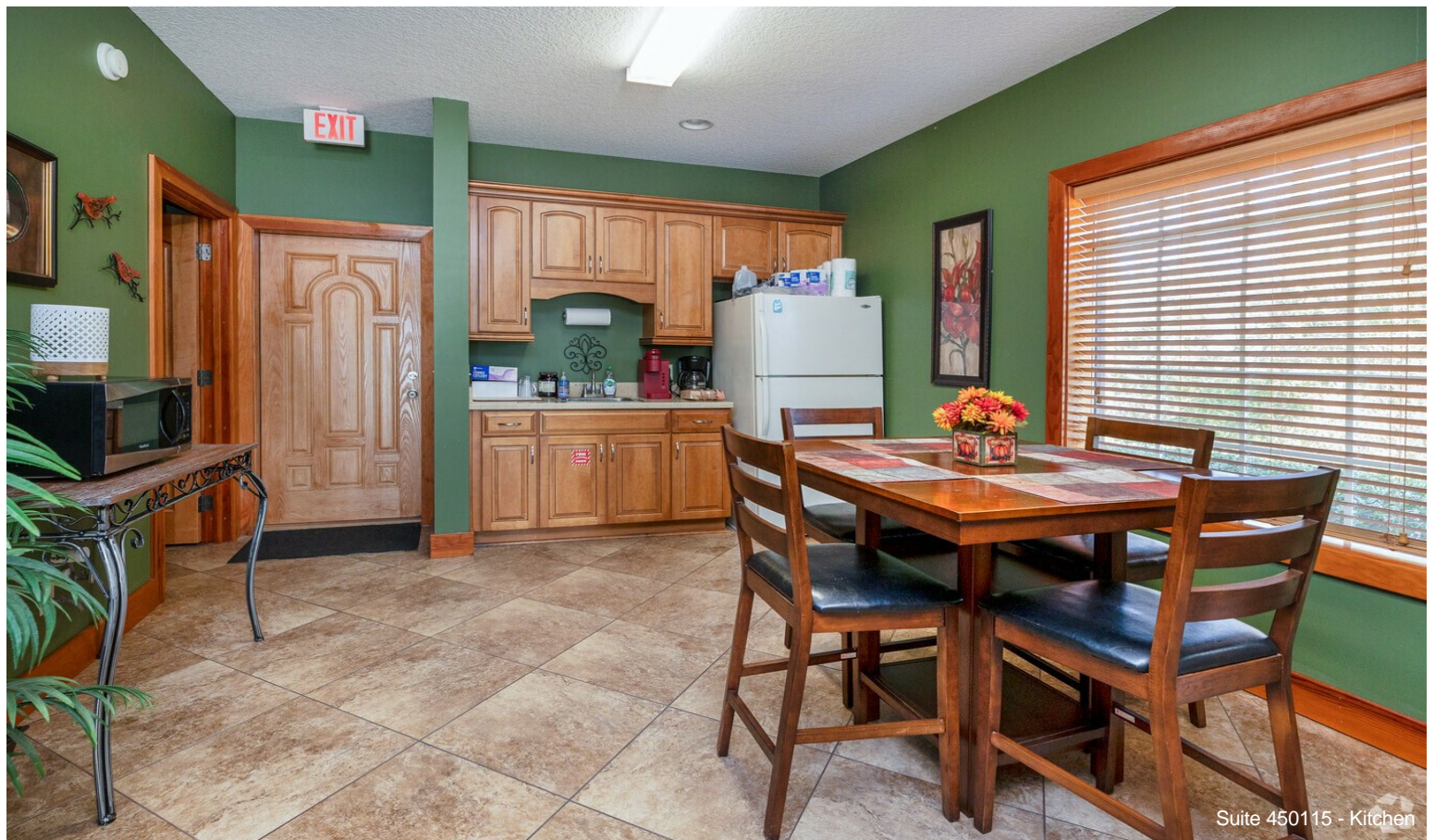
Suite 450115 - Kitchen