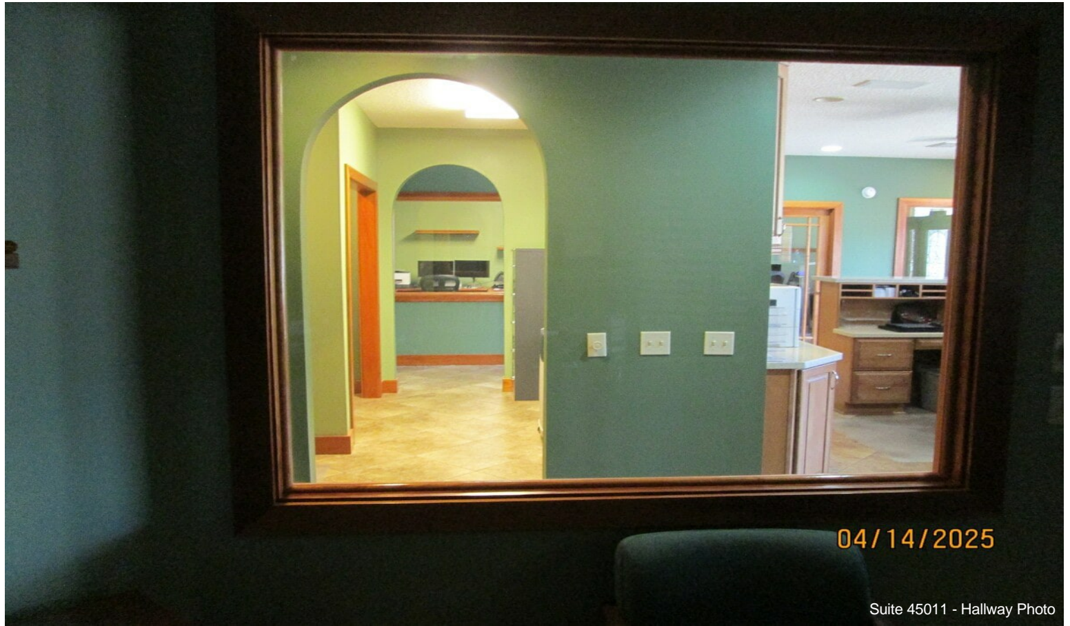
Suite 45011 - Hallway Photo