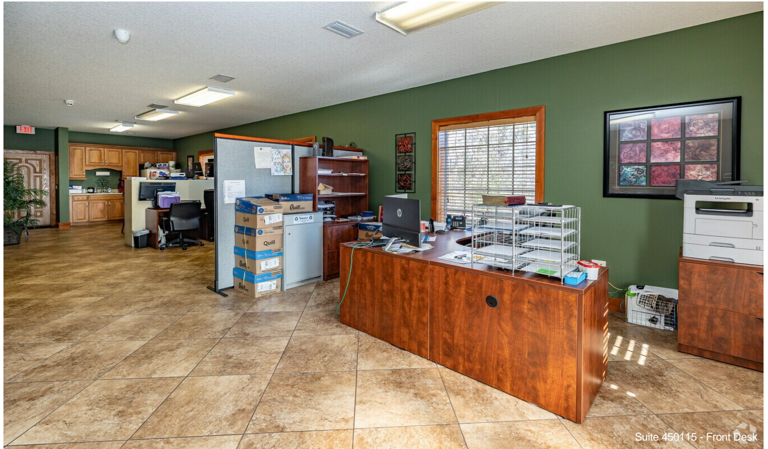
Suite 450115 - Front Desk