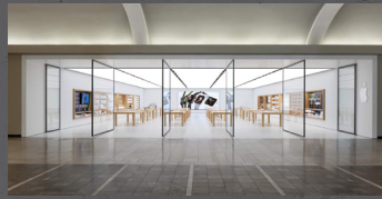
PENN SQUARE MALL