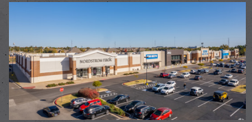
BELLE ISLE STATION