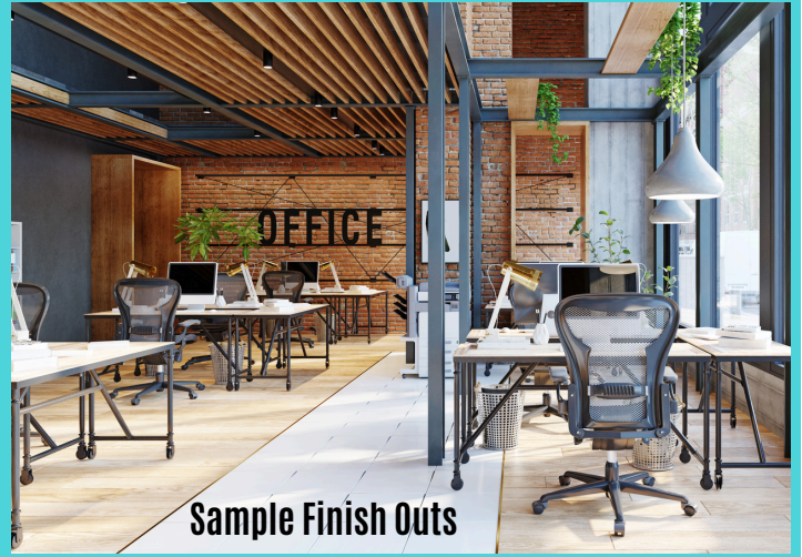
Sample Finish Outs