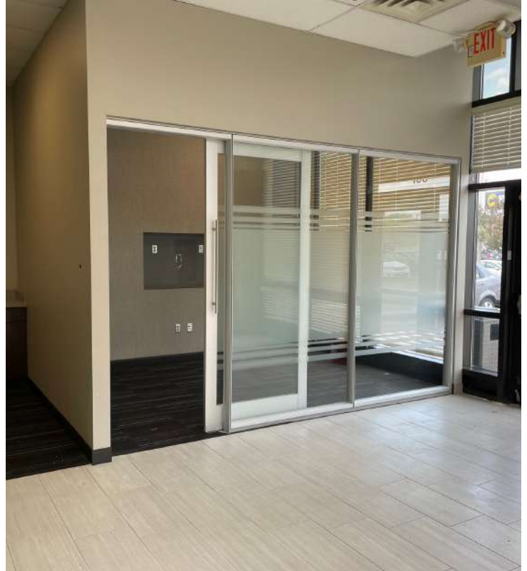
Conference Room off Reception Area