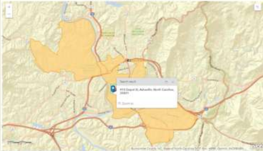
Opportunity Zones Map

A permanent exclusion from taxable income of capital gains from the sale or exchange of an investment in an Opportunity Fund if the investment is held for at least 10 years. This exclusion only applies to gains accrued after an investment in an Opportunity Fund.