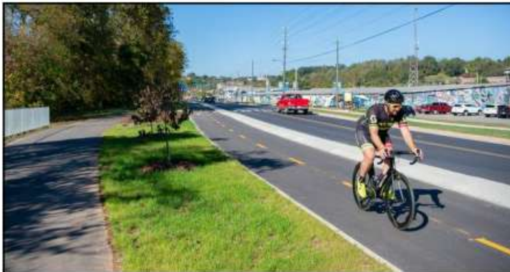
Portion of completed greenway on Lyman Street

The River Arts District Transportation Improvement Project (RADTIP) is a City of Asheville multi-modal transportation project that includes the installation of sidewalks, street trees, public art, bike lanes and greenways in the River Arts District, adjacent to the French Broad River. The City engaged the community multiple times throughout the years to form the vision for RADTIP. It will not only increase safety for pedestrians, bicyclists and motorists, but also incorporate a greenway and new recreation facilities along the French Broad River. Half of the construction cost of RADTIP is funded through a $14.6 million TIGER VI grant from the federal Transportation Department, a $3.5 million grant from the Buncombe County Tourism Development Authority, and two grants from state of North Carolina. The City share comes from a combination of parking and stormwater funds, general funds and City debt proceeds used to finance the Capital Improvements Plan. Asheville's mayor, Esther Manheimer said that the project is one of several, likely to have a direct economic impact: "If you put that infrastructure in the River Arts District, you're going to see investment down there," she said. In September 2020, a portion of the trail called the French Broad River East Bank Corridor was completed. See article HERE for more information.