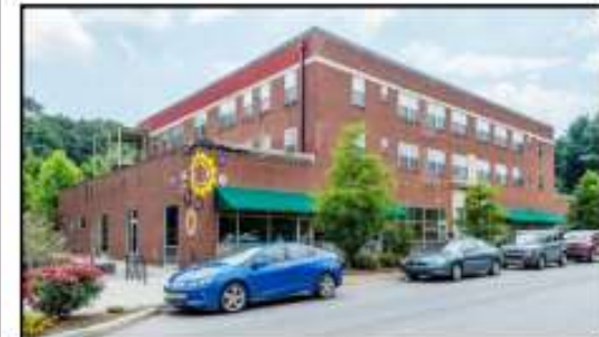
Glen Rock Depot