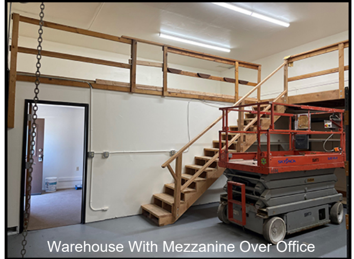
Warehouse With Mezzanine Over Office