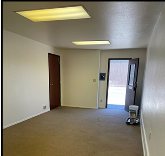
Office Front View

COLDWELL BANKER COMMERCIAL BROKERS OF THE VALLEY