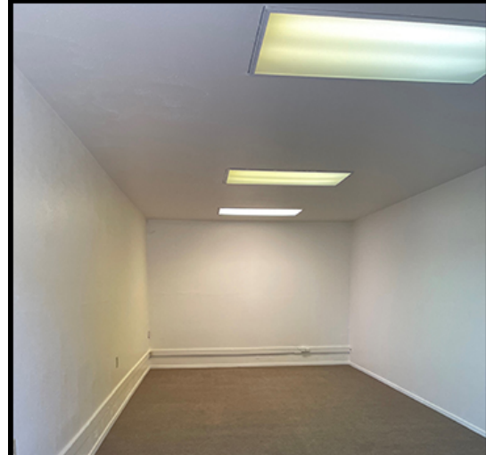
Office Rear View