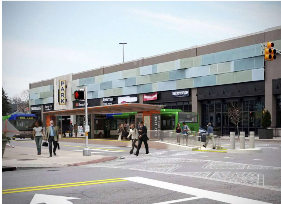
Broad Ripple Station Rendering.

Throughout most of the day, buses will arrive every ten minutes, and the Red Line will operate for 20 hours each day, 7 days a week.