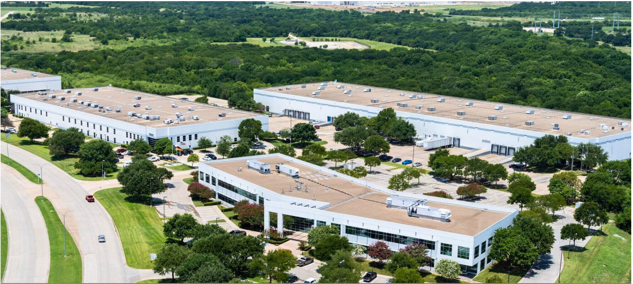
Located in AllianceTexas , home to 60+ Fortune 500 Companies