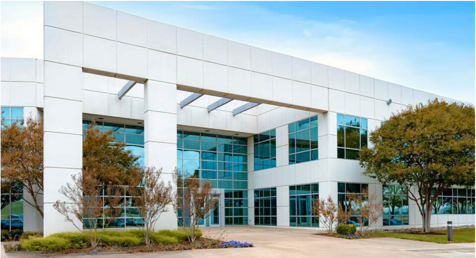
Easy access to entry

73,747 RSF total building area 36,874 RSF typical floorplate 4:1,000 parking ratio 1998 year built 2 stories