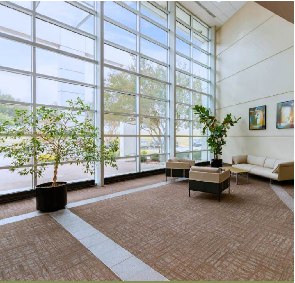
Floor to ceiling glass in the atrium