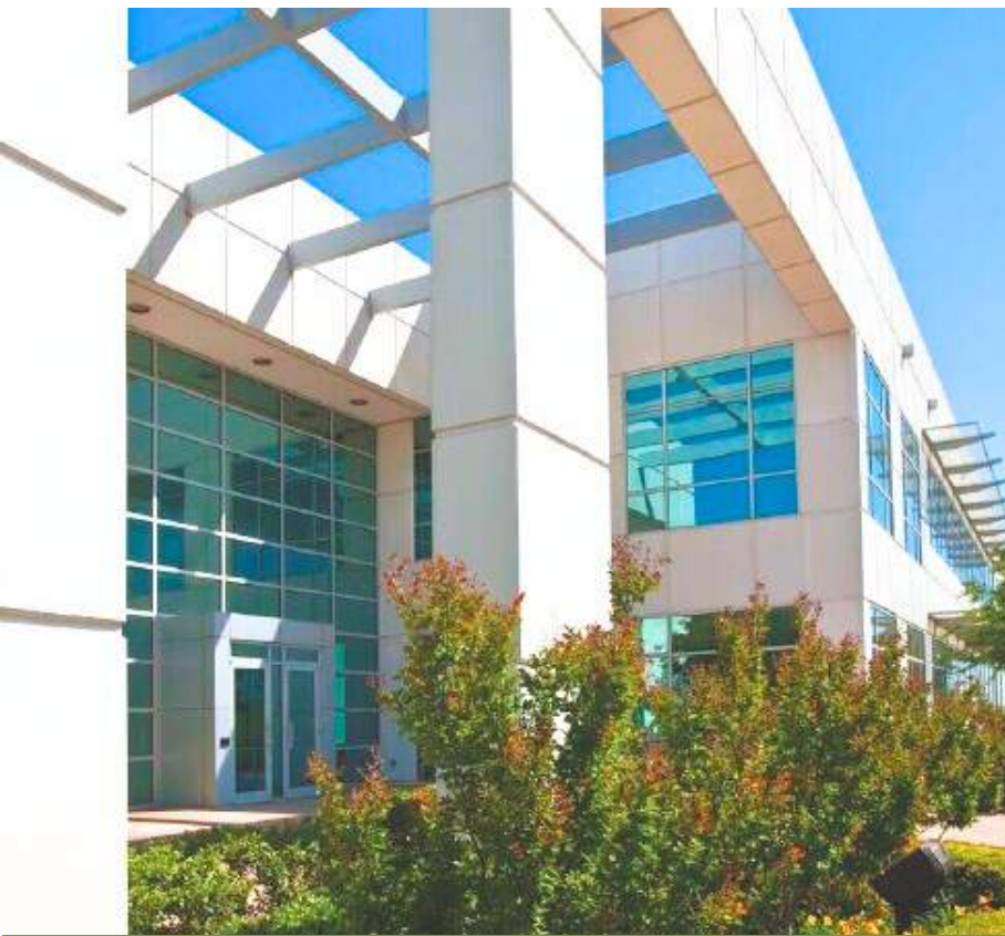
Ample surface parking for employees and visitors

73,747 RSF total building area 36,874 RSF typical floorplate 4:1,000 parking ratio 1998 year built 2 stories