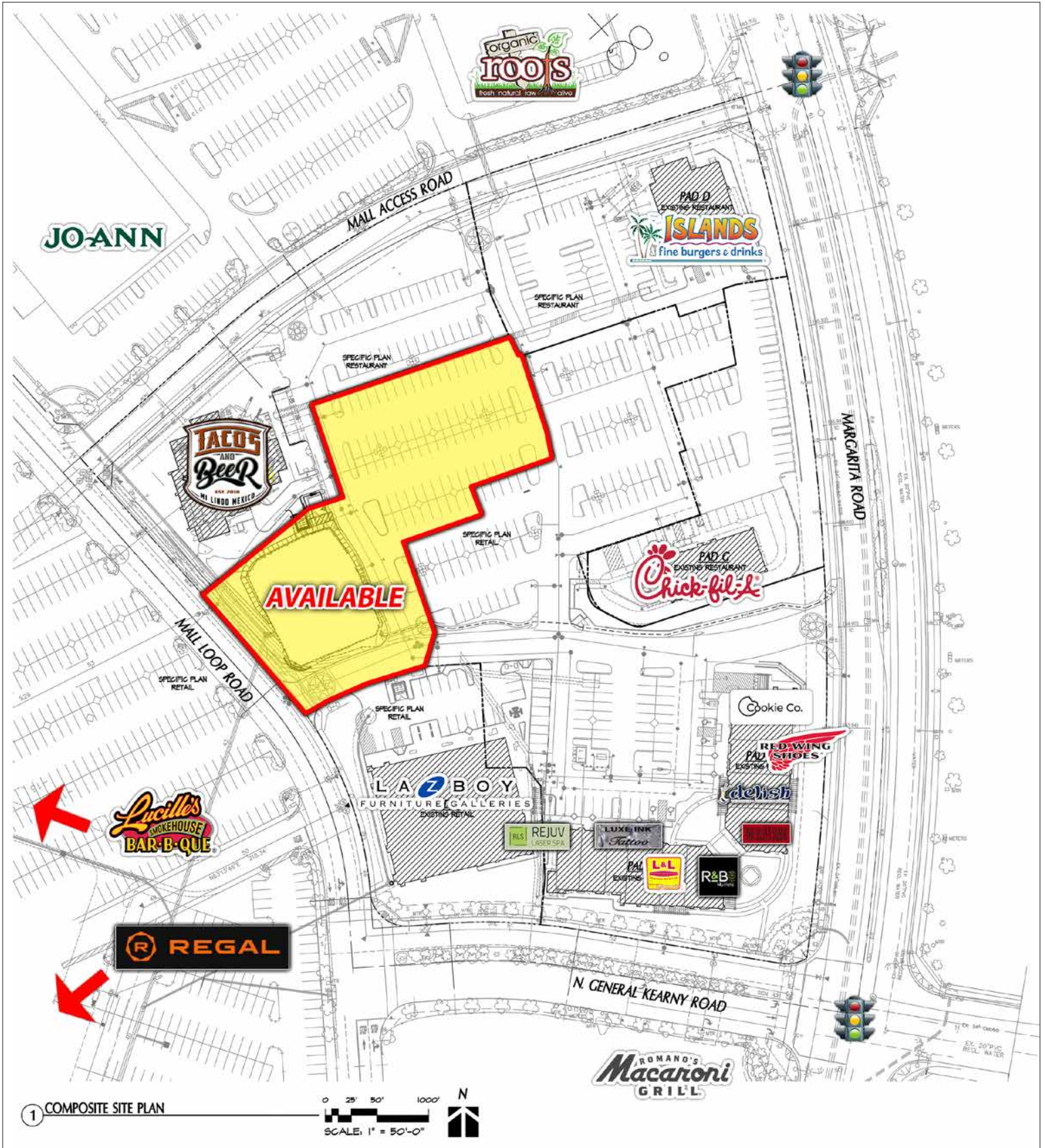
1 COMPOSITE SITE PLAN