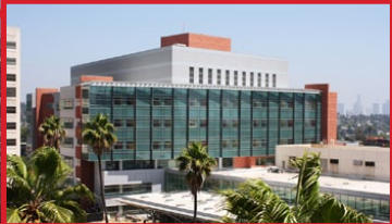
CHILDREN'S HOSPITAL LA