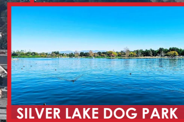
SILVER LAKE DOG PARK