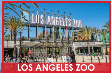
LOS ANGELES ZOO