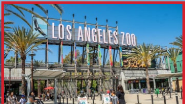
LOS ANGELES ZOO