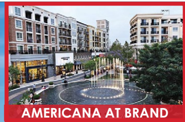
AMERICANA AT BRAND