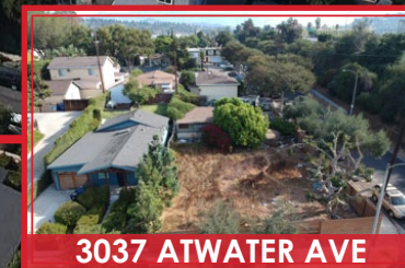
3037 ATWATER AVE

HAN WIDJAJA CHEN, CCIM DIR. 626.594.4900 DRE# 01749321