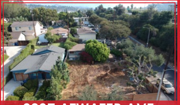
3037 ATWATER AVE

HAN WIDJAJA CHEN, CCIM DIR. 626.594.4900 DRE# 01749321