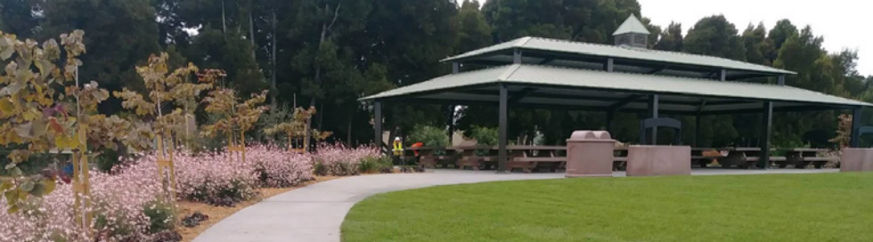
JEAN SWEENEY OPEN SPACE PARK