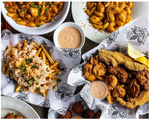
SOUTHERN COMFORT KITCHEN