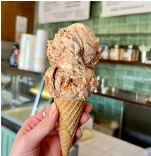
COOKIE BAR SCOOP SHOP