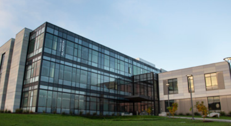
COLLEGE OF ALAMEDA