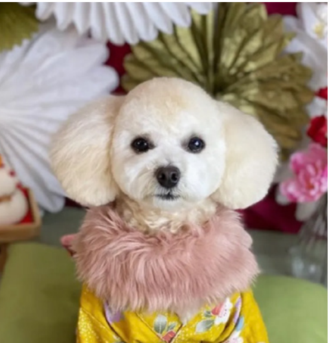
UNDER ONE WOOF GROOMING

Alameda—known affectionately as “The Island City”—is a well-connected East Bay gem blending historic charm with modern vibrancy.