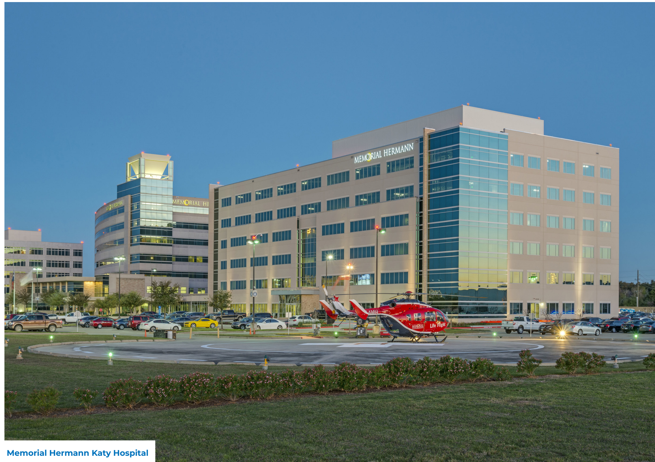
Memorial Hermann Katy Hospital

Katy Medical Plaza is within a short drive to four major hospital systems (Memorial Hermann, Houston Methodist, Texas Children's and St. Luke's). And surrounded by Houston's established and diverse communities. Katy residents are well-educated and earn higher incomes compared to the rest of the city. The area continues to experience growth, with new developments sprouting throughout the region.