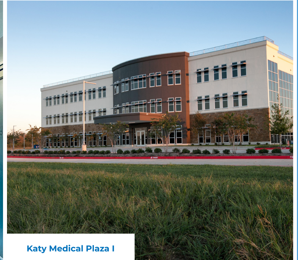
Katy Medical Plaza I