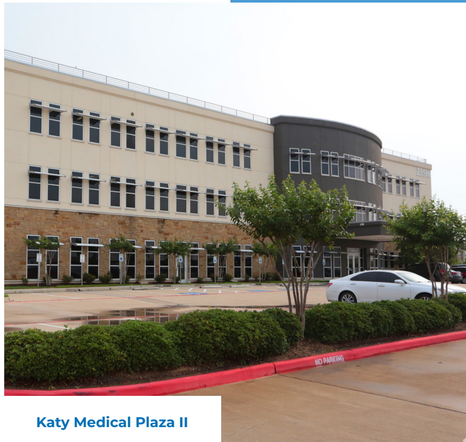
Katy Medical Plaza II