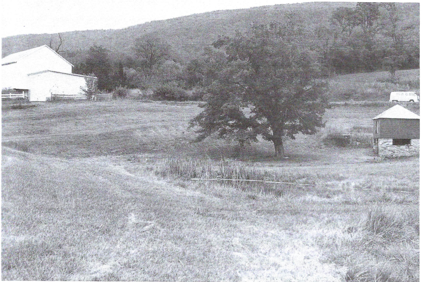
Remains of the spa as it looks today. All seven springs were located in this general area. The main hotel was located where the barn at the upper left is now.