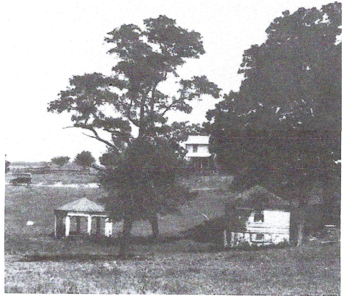
Remains of Burner's White Sulphur Springs in the early 1900's. The spring house in the center has been gone for many years.

After the war, the resort never reopened but was used as a summer home by the Walton and Newman families up to the 1920s. Today the 400 acres of the former resort is owned by a corporation from Fairfax, Virginia. At one time a small fishing camp was operated here.