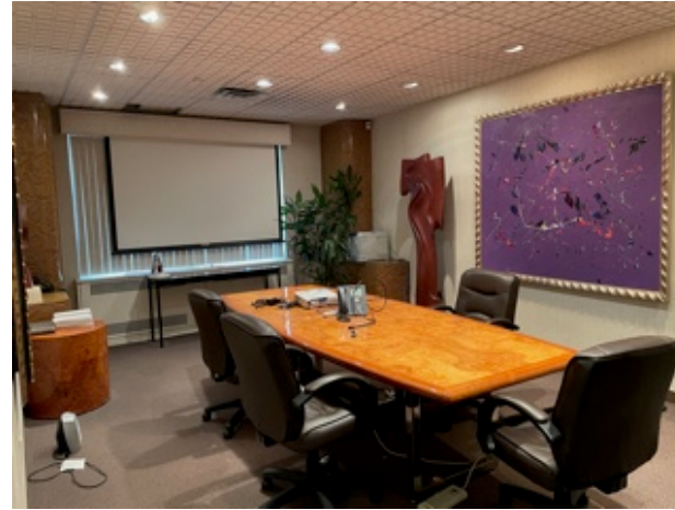
Board Room Off Reception