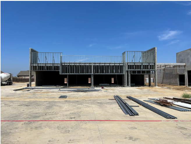
2,779sf In-Line Space Available