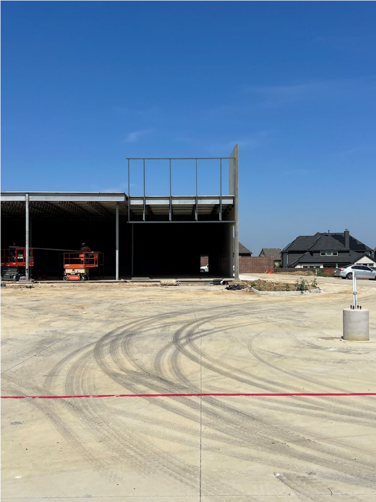
3,005sf Endcap with Drive-Thru Available