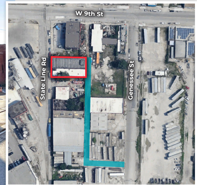
Rear Access Easement

CONNOR WELTMER cweltmer@Crossroads-KC.com M (913) 230-3986