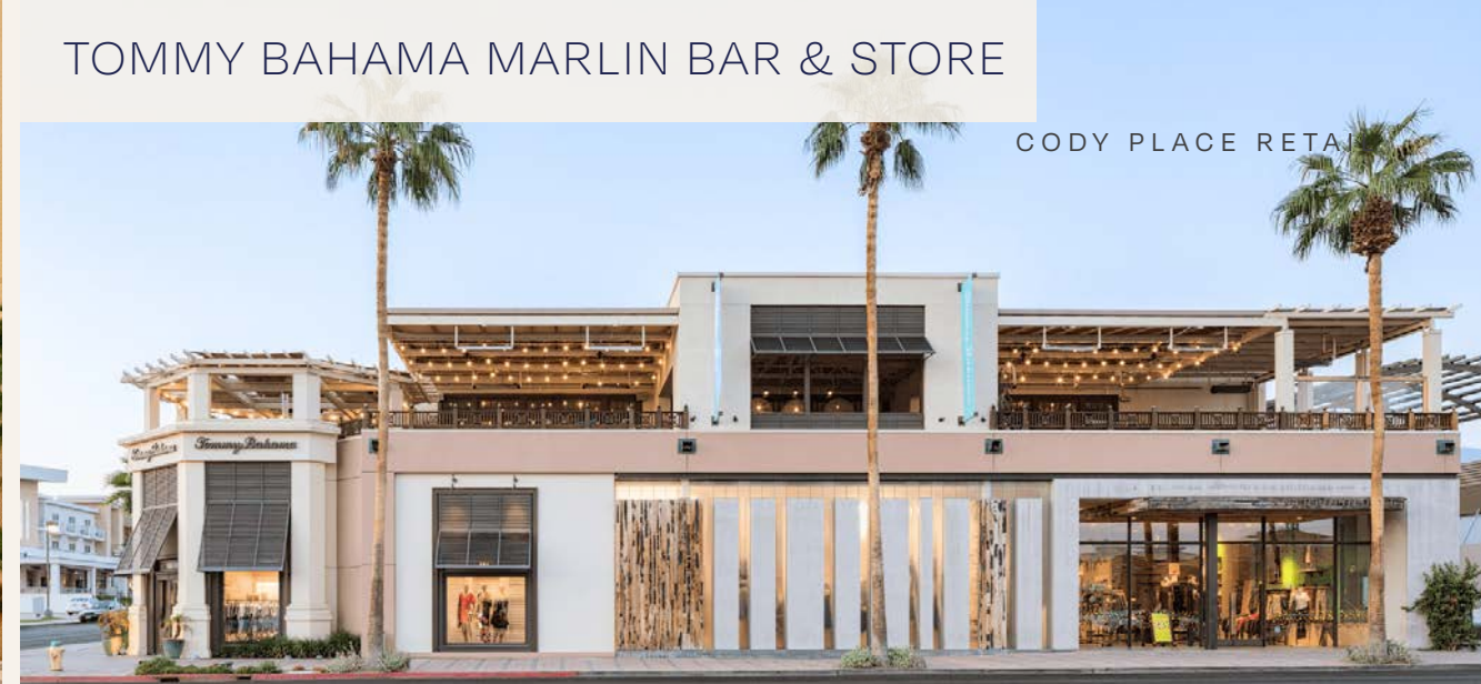
CODY PLACE RETAIL