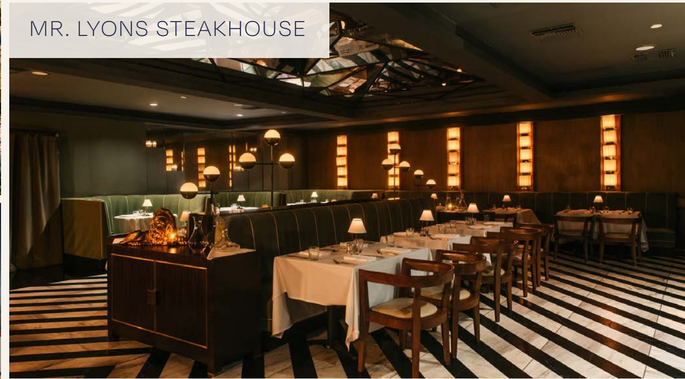
MR. LYONS STEAKHOUSE