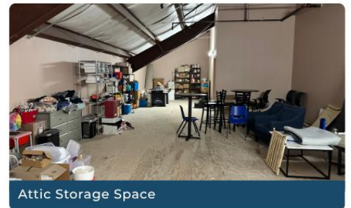
Attic Storage Space