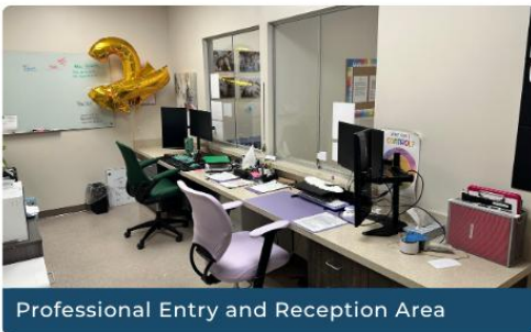
Professional Entry and Reception Area