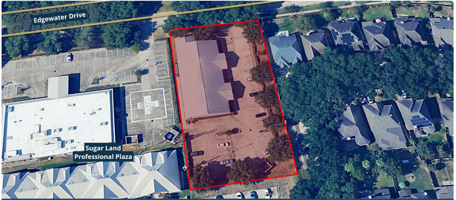
Adjacent to Sugar Land Professional Plaza — an established medical corridor with 12+ healthcare providers