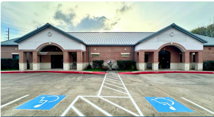
Five Entry Points for Flexible Access