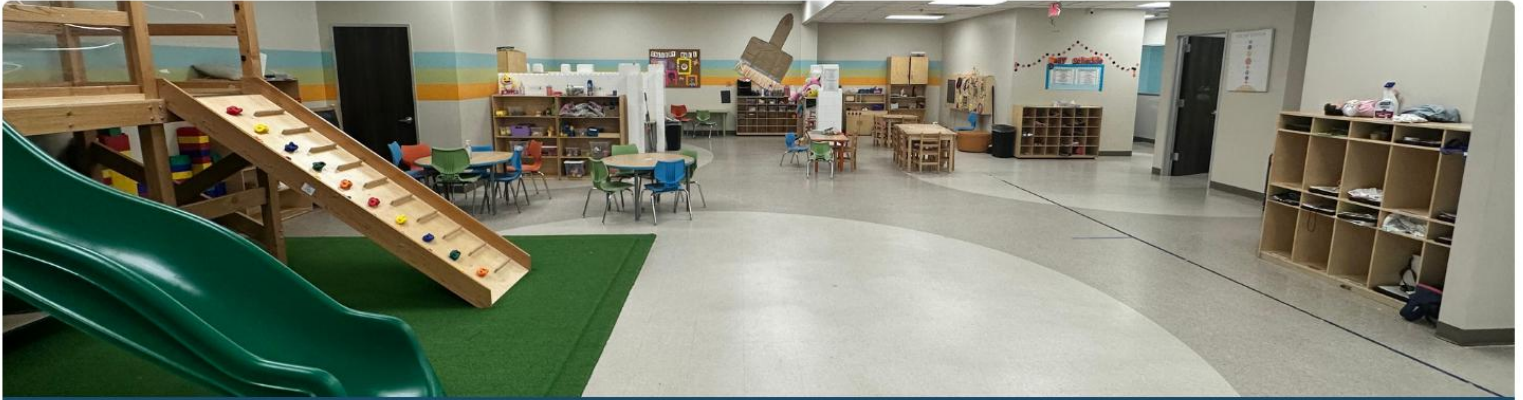
Expansive Open Floor Plan