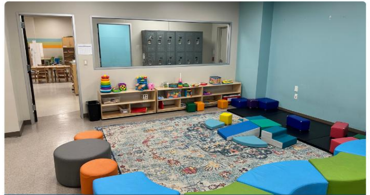
Behavioral Health-Ready Classroom with Observation Mirror