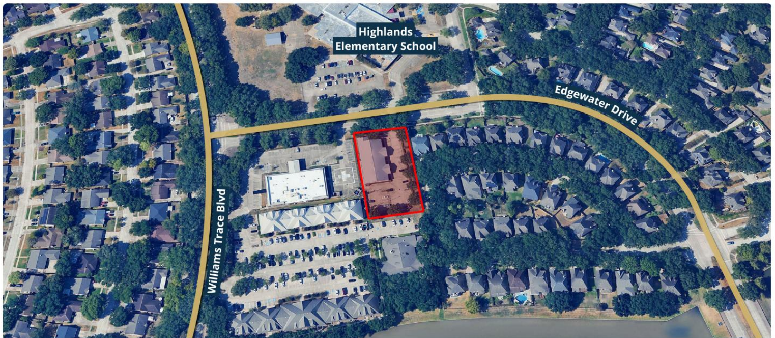
Adjacent to Highlands Elementary School