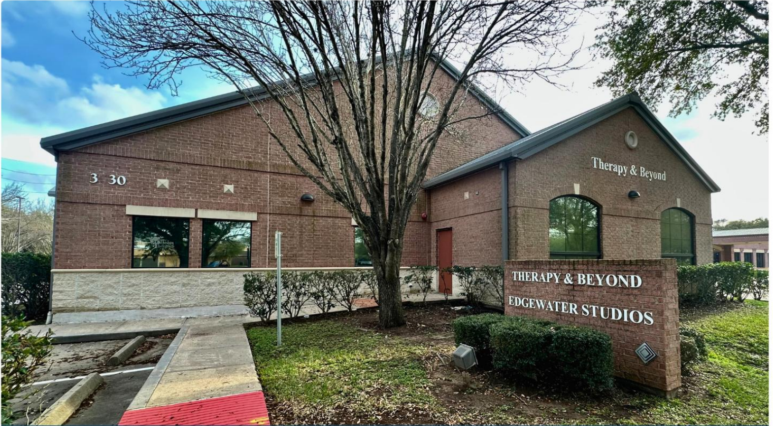
Two-Story Office Building with Frontage on Edgewater Drive