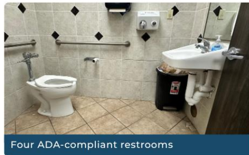
Four ADA-compliant restrooms