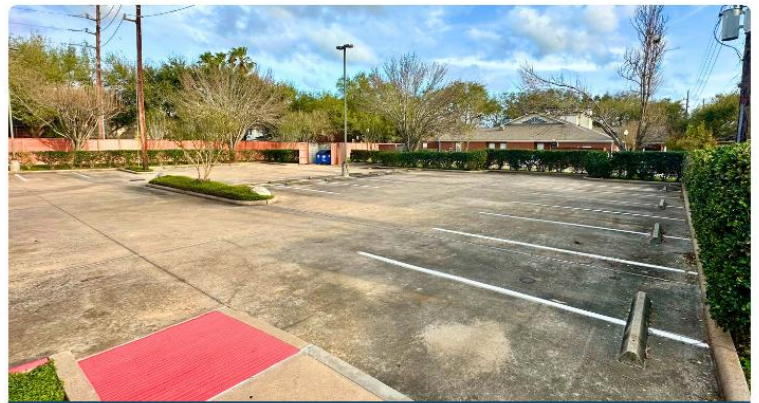
Ample On-Site Parking with 44 Spaces (2 ADA-accessible)