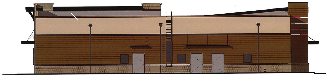
① REAR ELEVATION 3/32" = 1'-0"