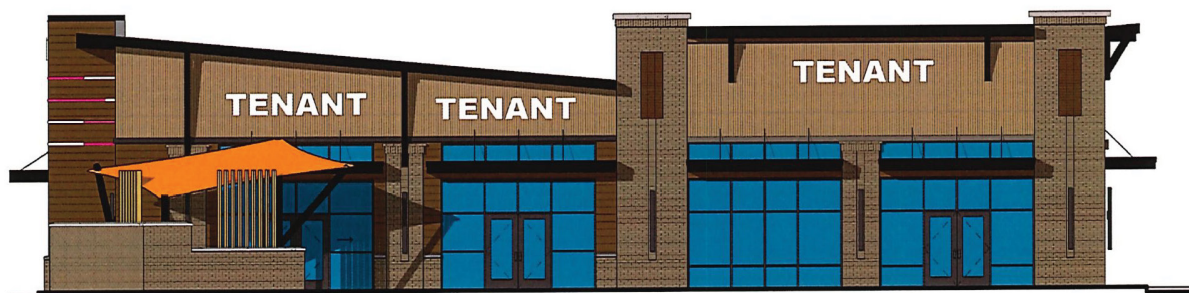
③ FRONT ELEVATION 3/32" = 1'-0"