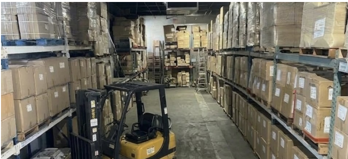
Warehouse interior with forklift